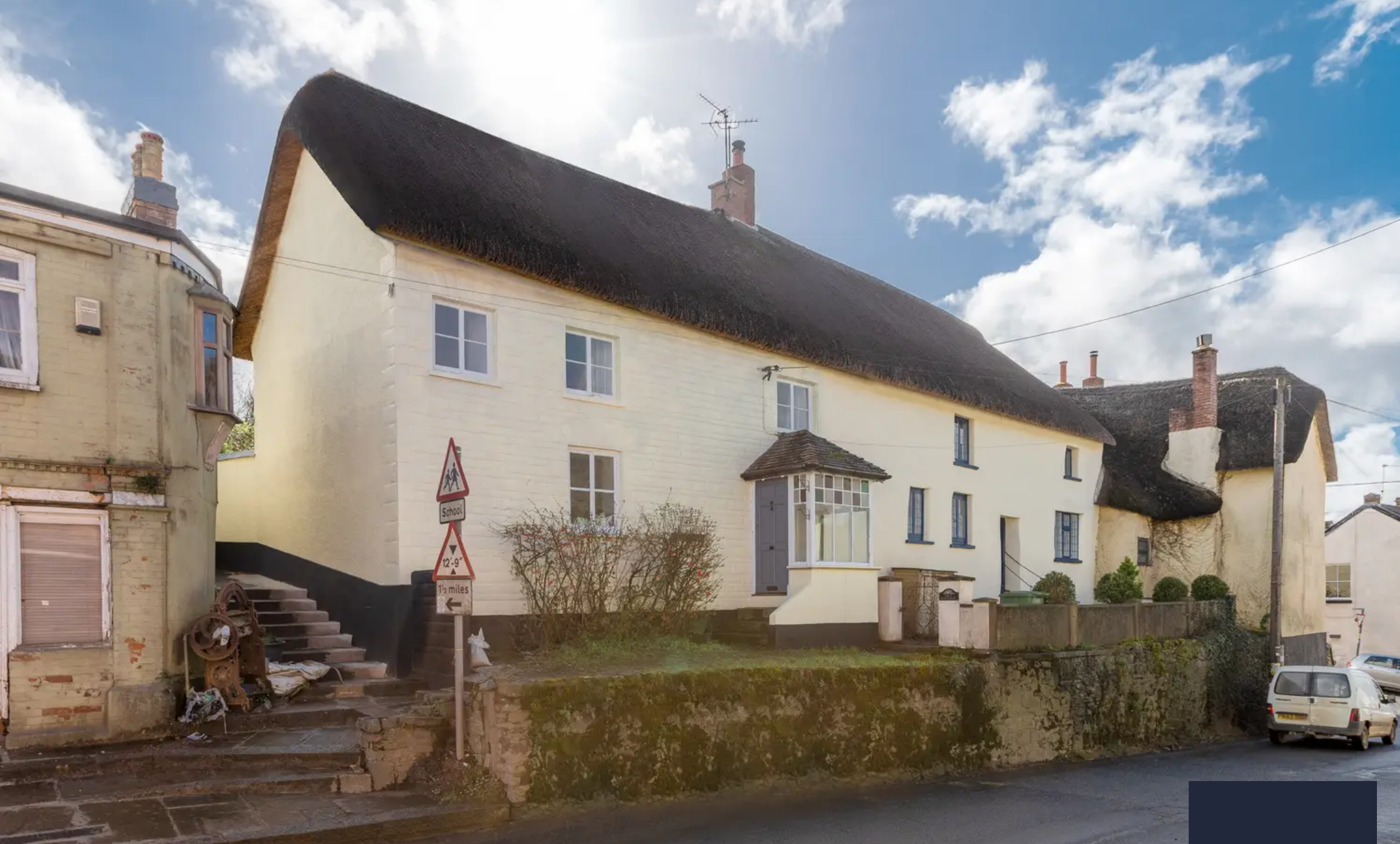
Godfreys House, Bow, Crediton £1,150 pcm