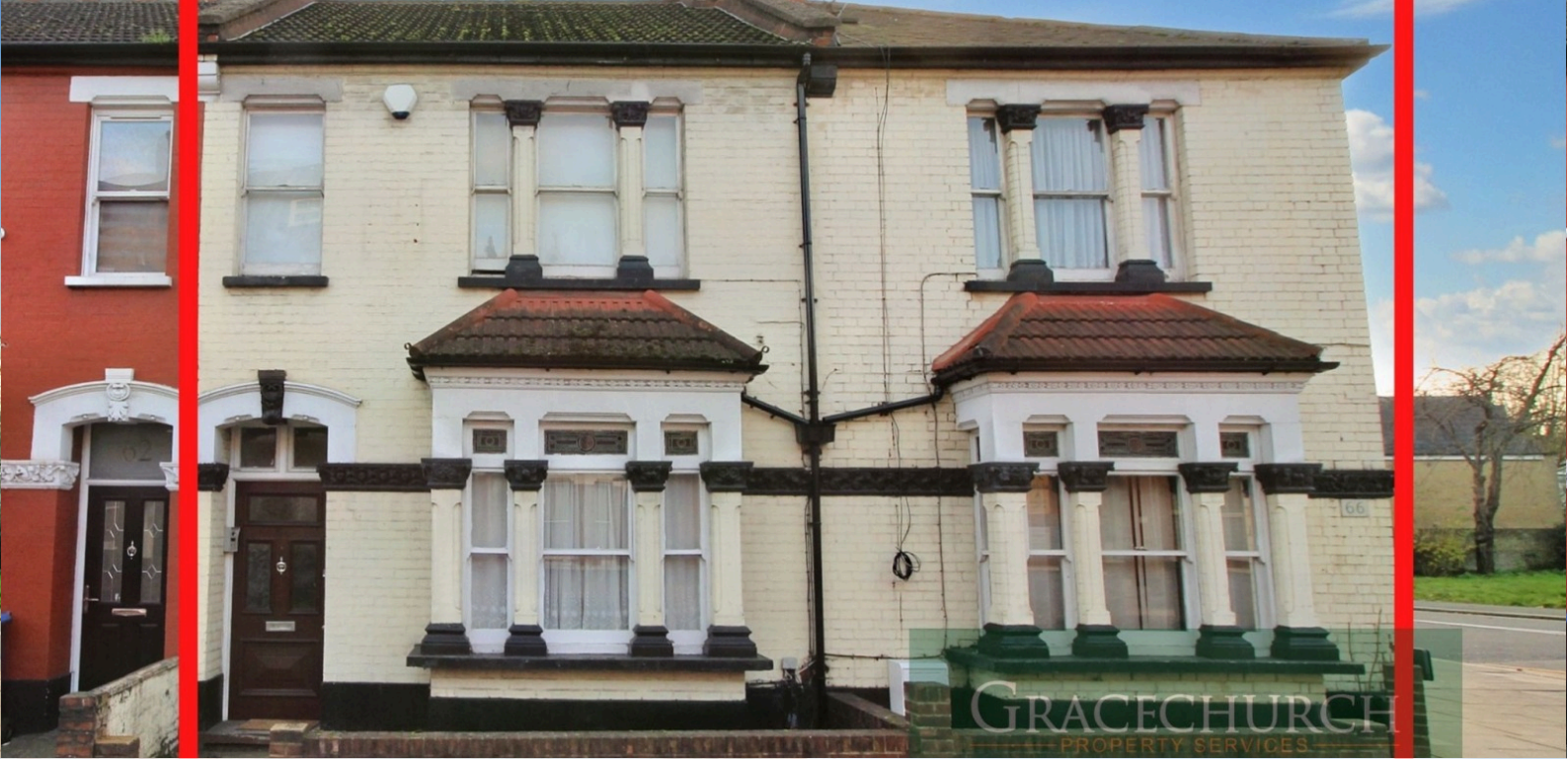
Approximate Gross Internal Area = 1,249 SqFt