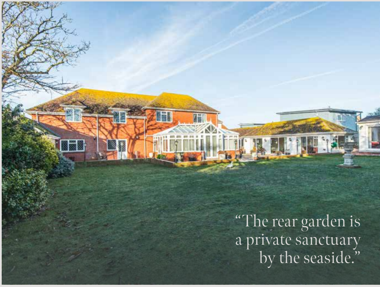
“The rear garden is a private sanctuary by the seaside.”