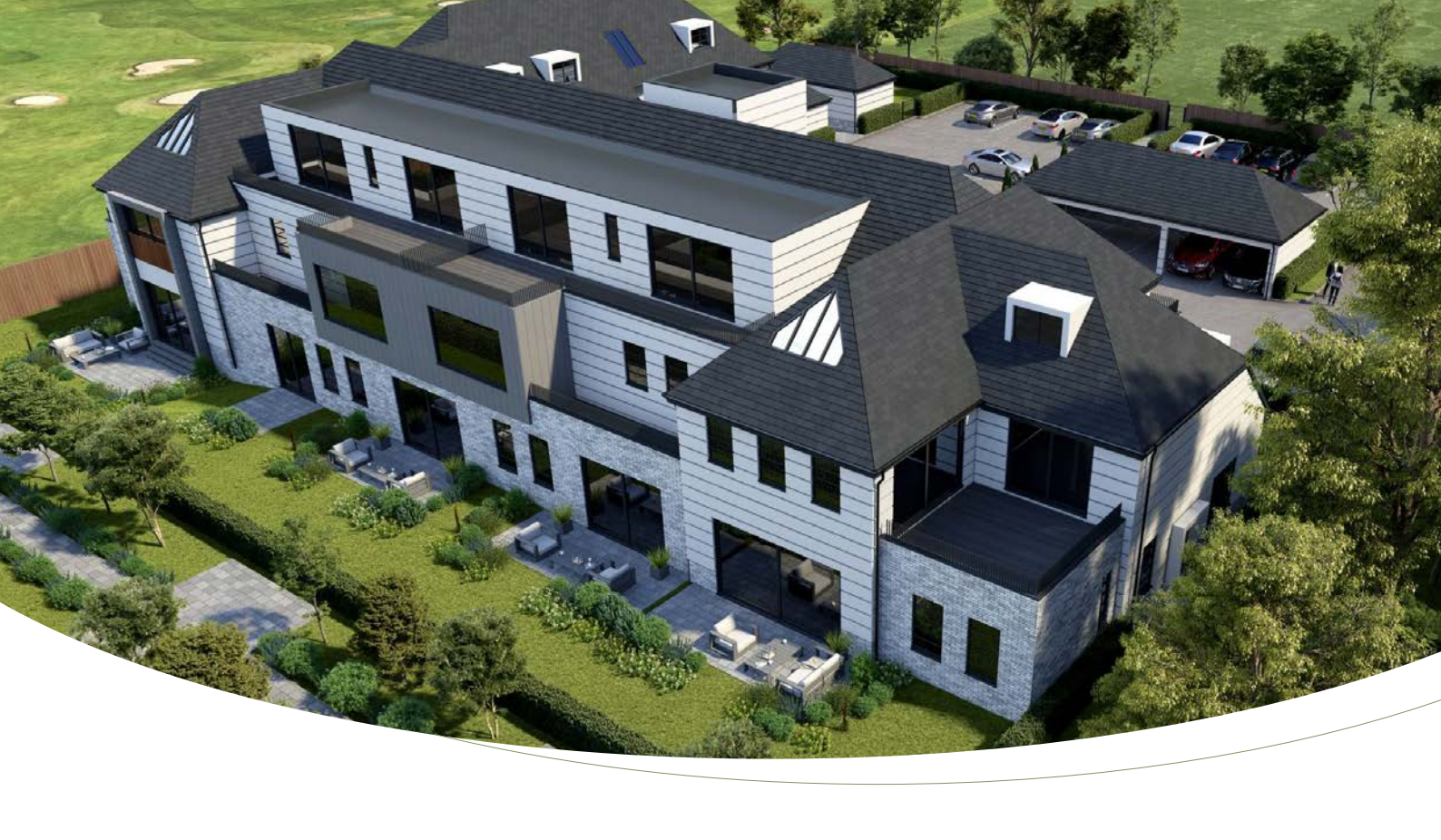
The Fairways | Convent Road | Broadstairs