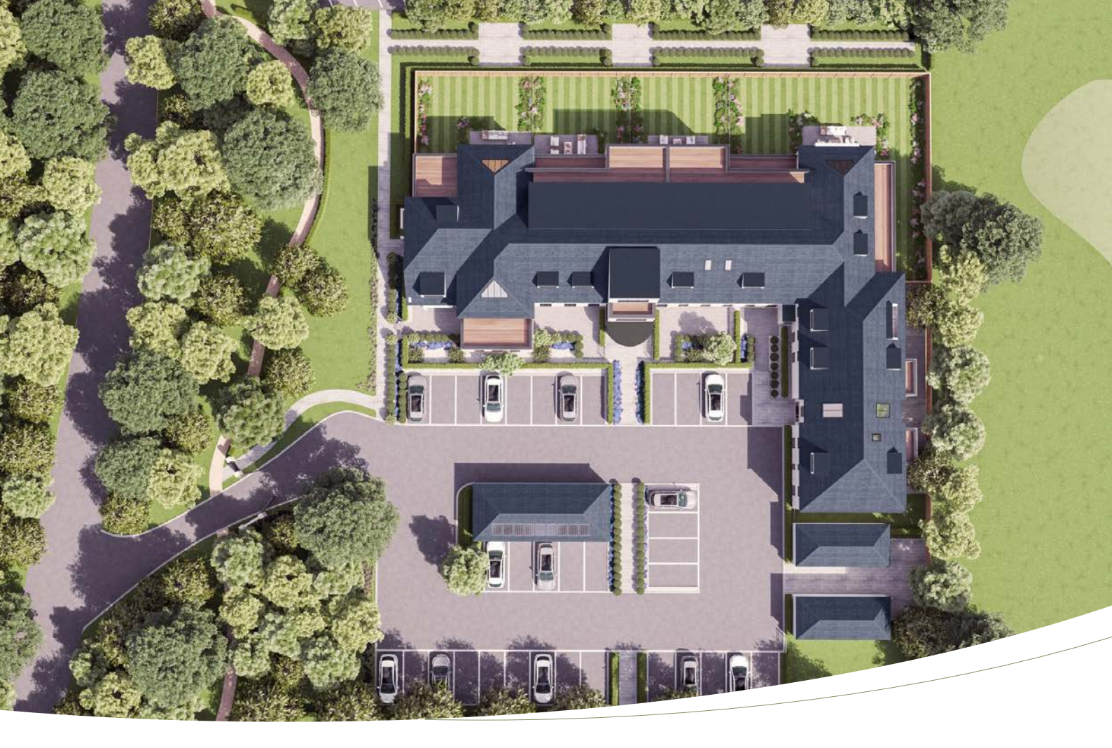
The Fairways | Convent Road | Broadstairs | CT10 3PX