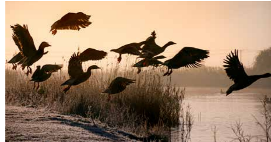
Geese on the Norfolk Broads

“The early morning quietness of the Broad is beautiful...it's wonderful to watch the geese and swans flying over.”