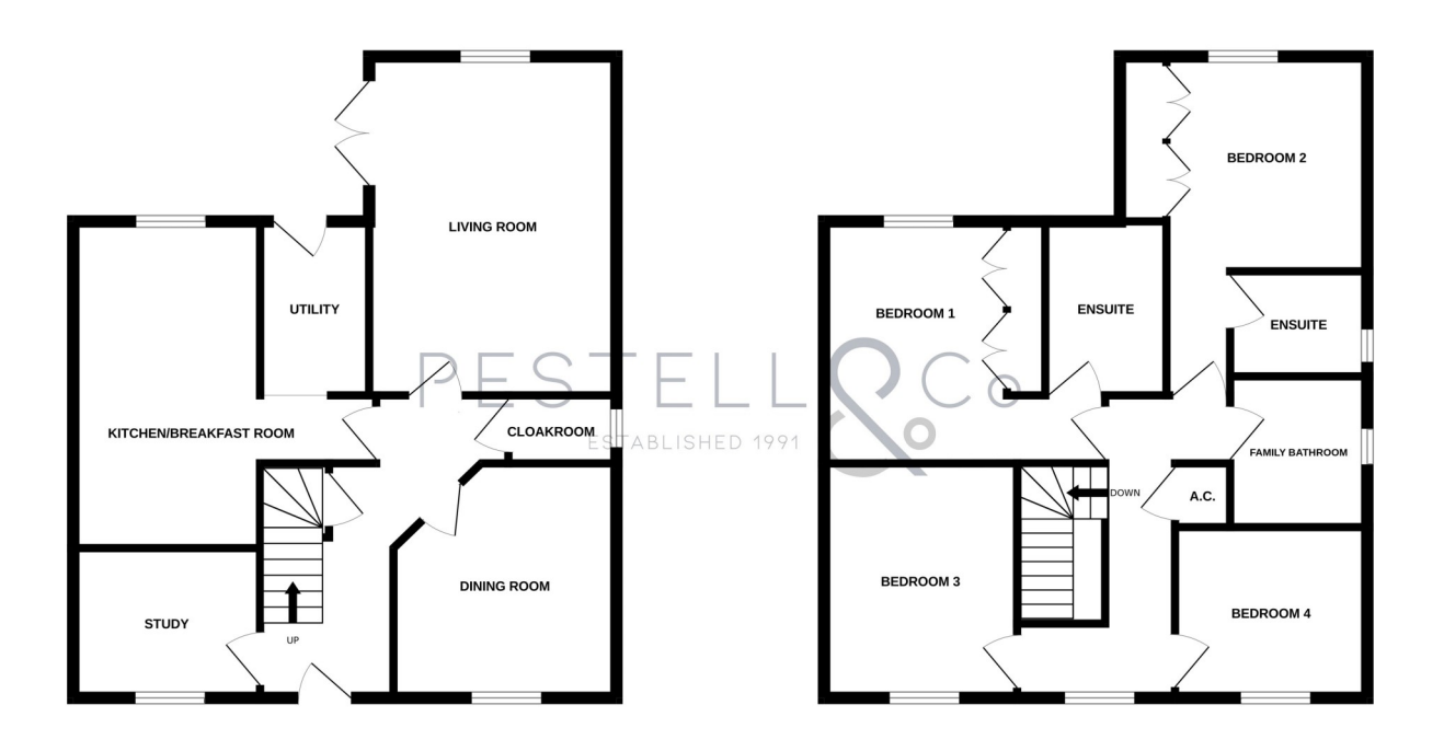
TOTAL FLOOR AREA: 1346 sq.ft. (125.0 sq.m.) approx.

Whilst very uttering has been made to ensure the accuracy of the floorplan contained free, measurement of donors, verdown, come and any other items are approximate and for reportulating is taken for any error, orisistion or mis-statement. This plan is for illustrative purposes only and should be used as such by any prospective purchaser. The services, systems and appliances shown have to been tested and no guarantee as to their operability or efficiency can be given. Ander with Merchyck (2023)