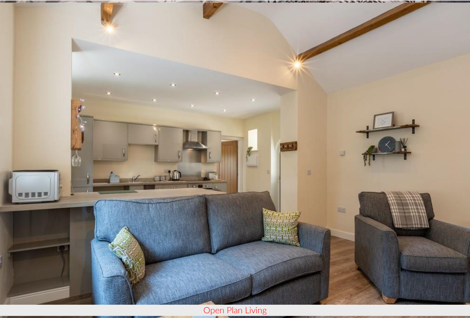
Open Plan Living