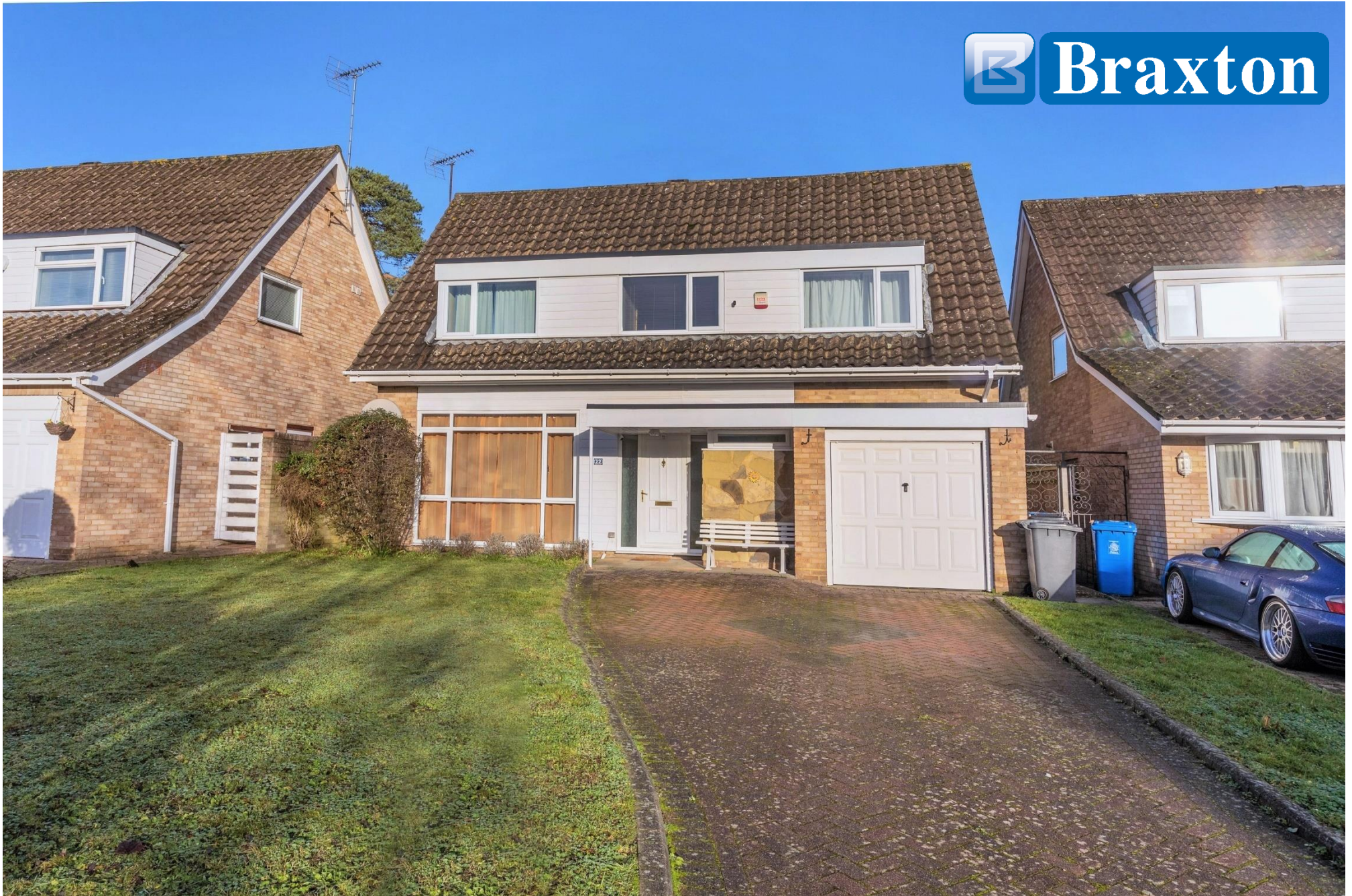
22 The Pagoda, Maidenhead, Berkshire SL6 8EU