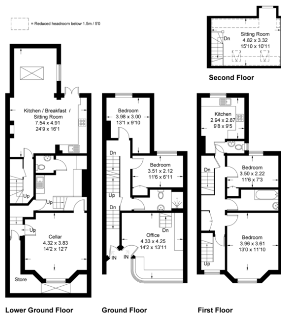
Illustration for identification purposes only, measurements are approximate, not to scale. Imageplansurveys @ 2023

After a long day at work is there any better way to switch off from the stresses of the world than to come home and pour yourself a glass of wine and relax in your private rear garden.