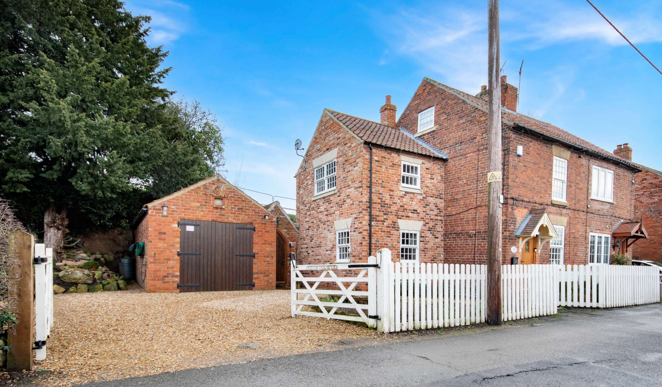
BLOSSOM COTTAGE, 62 BOLHAM LANE, RETFORD £315,000