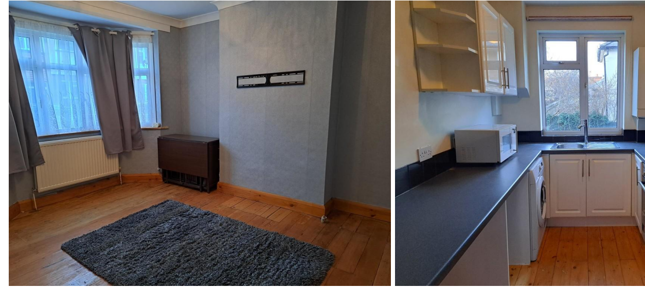
15 Bute Court, Bute Road, Wallington, Surrey, SM6 8AG | £275,000 Leasehold

Offered with no chain, this two bedroom ground floor apartment benefits from a long lease, gas central heating and shared garden. The property is located within a short walk of Wallington station and town centre with its a range of coffee shops, restaurants and supermarkets boasts two bedrooms, a good size lounge, fitted kitchen, bathroom and separate WC. There is a shared section of garden to the rear.