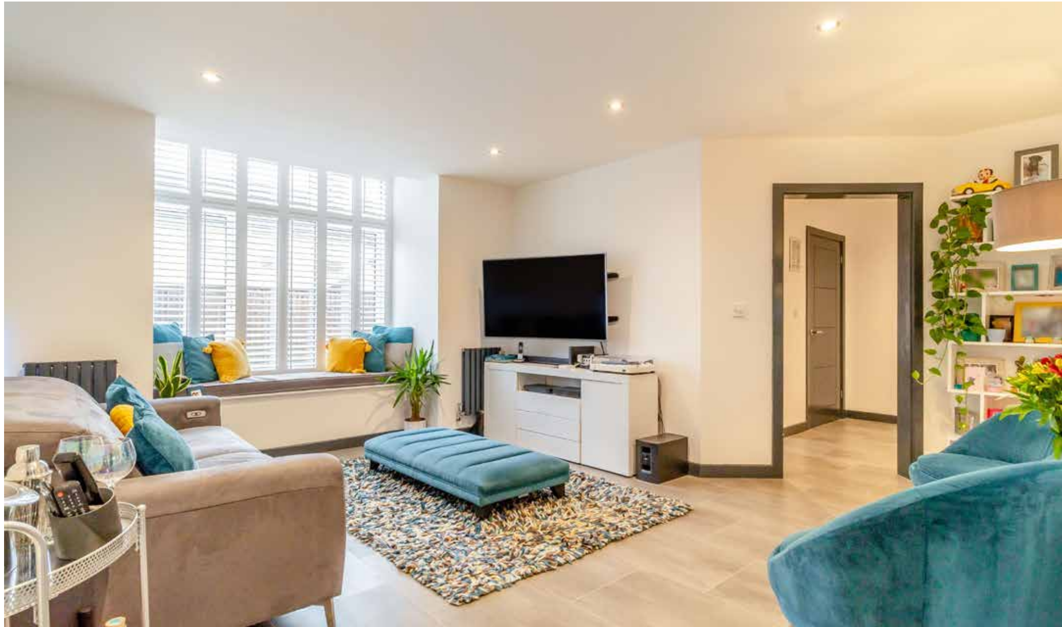
“Natural light pours in, illuminating the contemporary and stylish pale interior..”