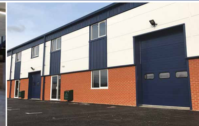
Indicative photos of similar scheme