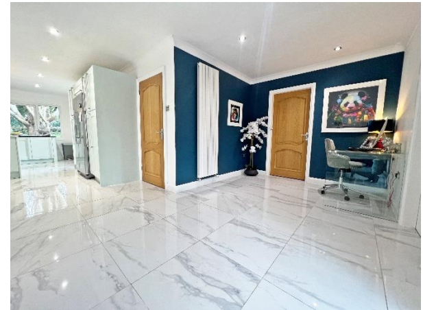
UTILITY (8'5" x 5'5" approx.) Wall and base units. Plumbed for washer/dryer. Marble floor.