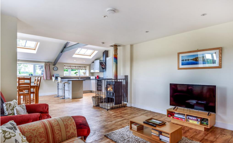
Open Plan Dining Kitchen / Living Room