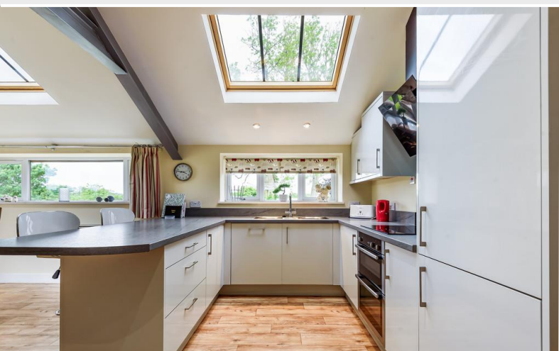
Open Plan Dining Kitchen / Living Room

A superbly converted three bedroom stone built barn in a delightful rural setting located under two miles from the historic picturesque village of Maulds Meaburn, eight miles from the Lake District National Park, nine miles from Appleby and thirteen miles from Penrith. Equally suitable as a primary home, second home or for lucrative holiday letting this most appealing property enjoys a delightful rural setting with views to the Lyvennet Valley within the Yorkshire Dales National Park.