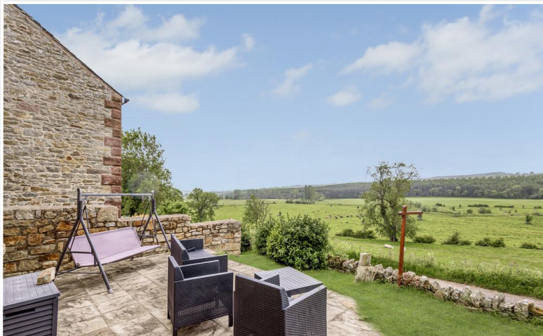
Patio and View