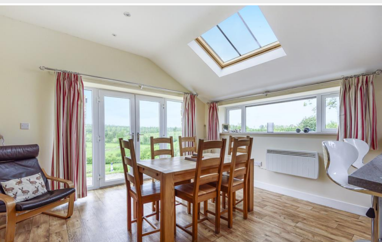
Open Plan Dining Kitchen / Living Room