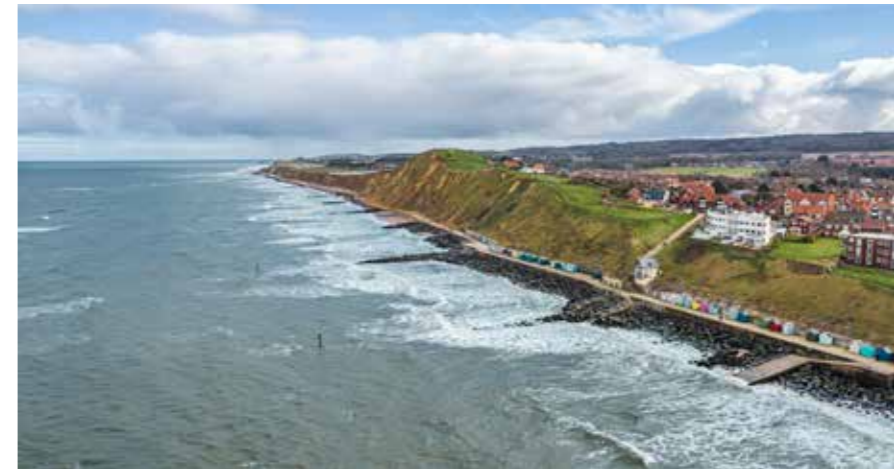
Sheringham sea front