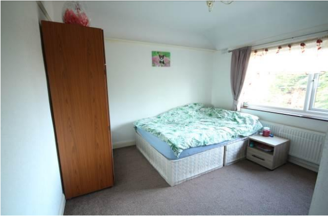
BEDROOM 2: 11' 4" x 11' 4" (3.45m x 3.45m) Radiator and double glazed window.