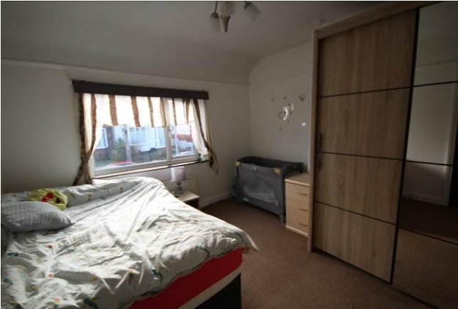
BEDROOM 3: 6' 9" x 6' 5" (2.06m x 1.96m) Radiator and double glazed window.