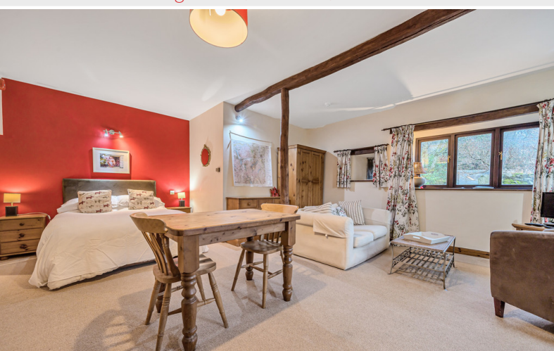
Living Room / Kitchen / Bedroom