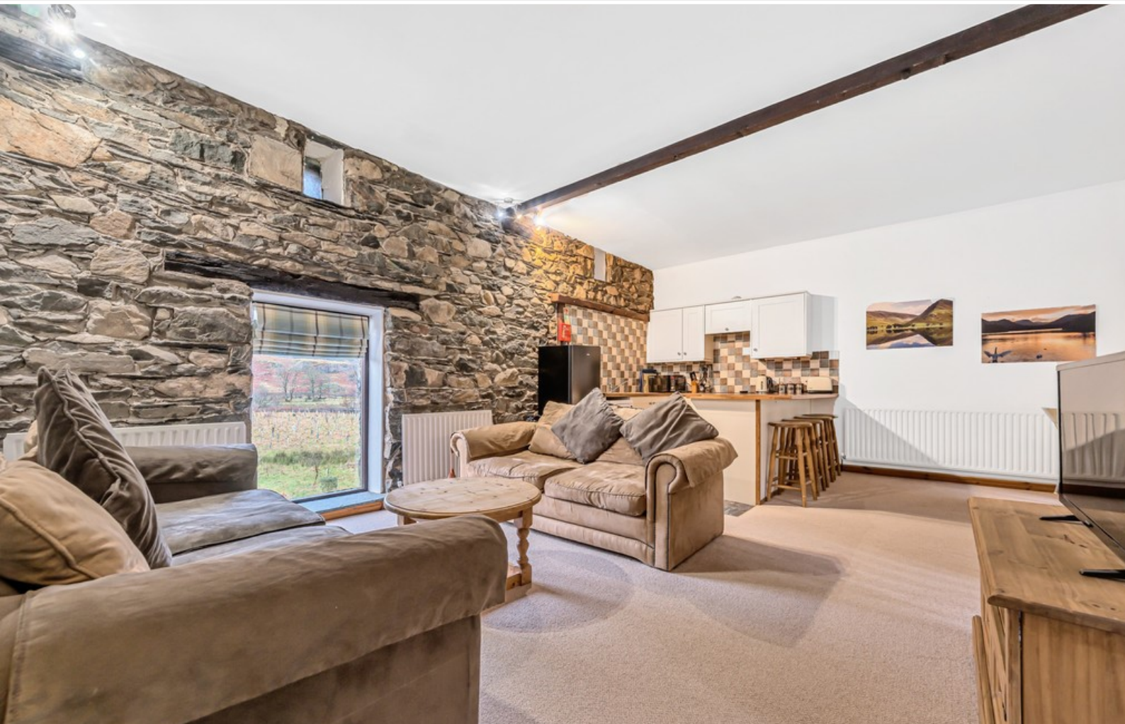
Living Room / Dining Room / Kitchen