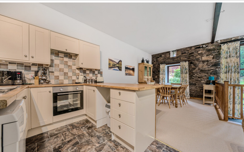
Living Room / Dining Room / Kitchen