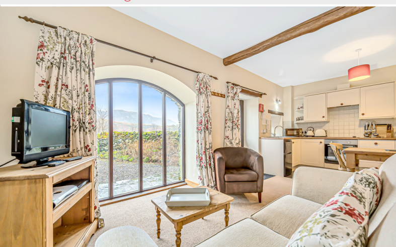
Living Room / Kitchen / Bedroom