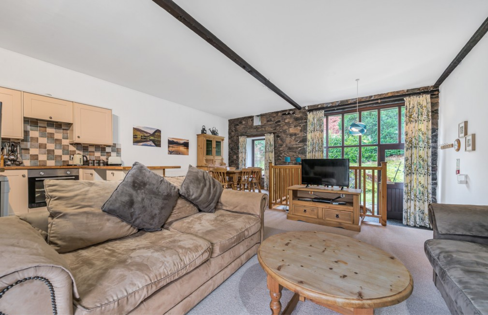
Living Room / Dining Room / Kitchen