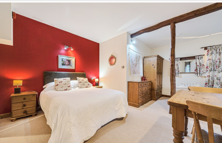
Living Room / Kitchen / Bedroom