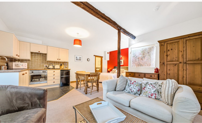
Living Room / Kitchen / Bedroom