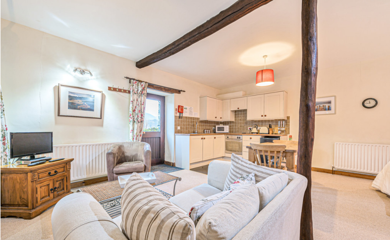
Living Room / Kitchen / Bedroom