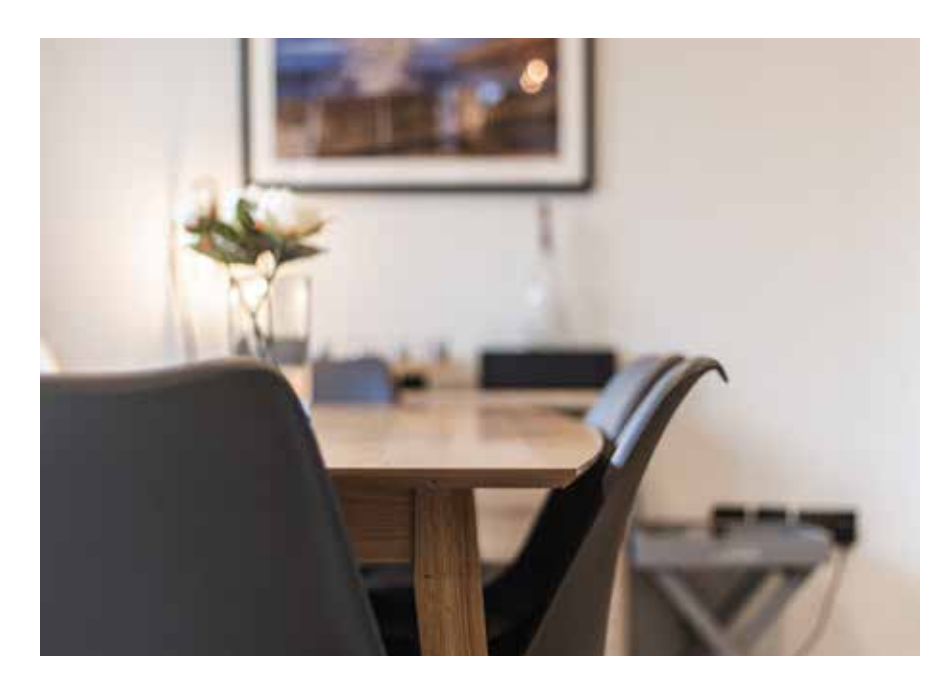
"A modern, stylish and spacious home."