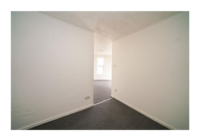
Bigger Back Flat Lounge