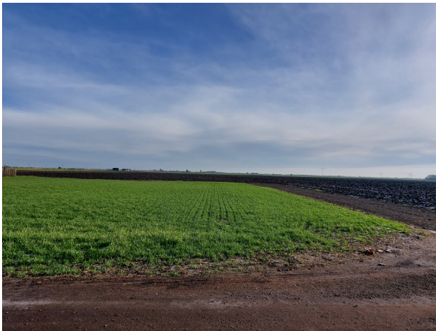
View of Plot 2 from Access Track

From the centre of March, follow Wisbech Road (B1099) out of town, continuing straight over at the mini roundabout to stay on Wisbech Road. At the Peas Hill roundabout, take the second exit onto Whittlesey Road. Follow the road for approximately 4.3 miles until you reach Turves. The plot can be found adjacent to 733 Whittlesey Road on the left-hand side, at the point where the road bends to the right and becomes March Road.