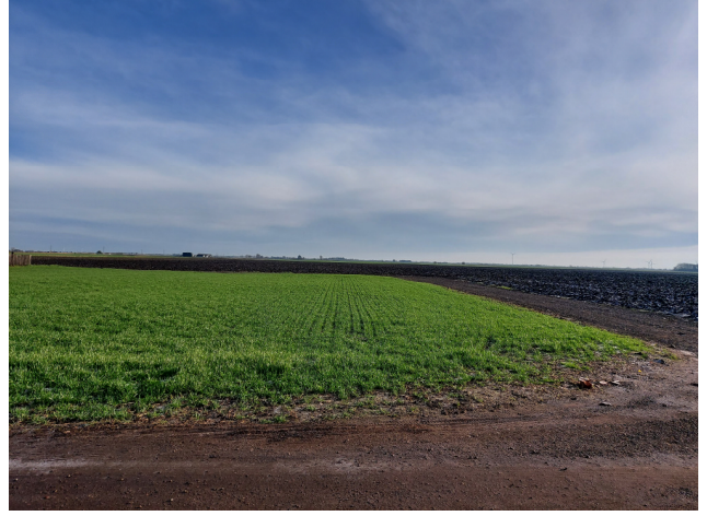
View of Plot 2 from Access Track

From the centre of March, follow Wisbech Road (B1099) out of town, continuing straight over at the mini roundabout to stay on Wisbech Road. At the Peas Hill roundabout, take the take the second exit onto Whittlesey Road. Follow the road for approximately 4.3 miles until you reach Turves. The plot can be found adjacent to 733 Whittlesey Road on the left-hand side, at the point where the road bends to the right and becomes March Road.