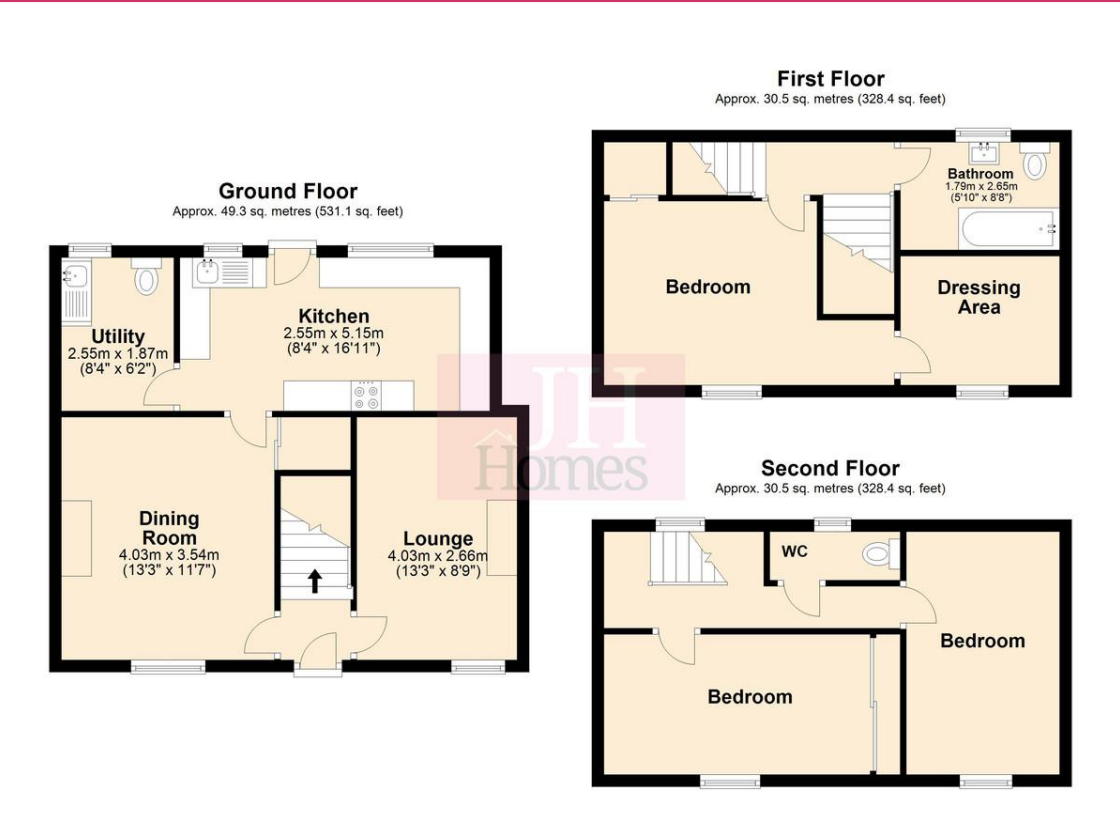
Total area: approx. 110.4 sq. metres (1187.9 sq. feet)