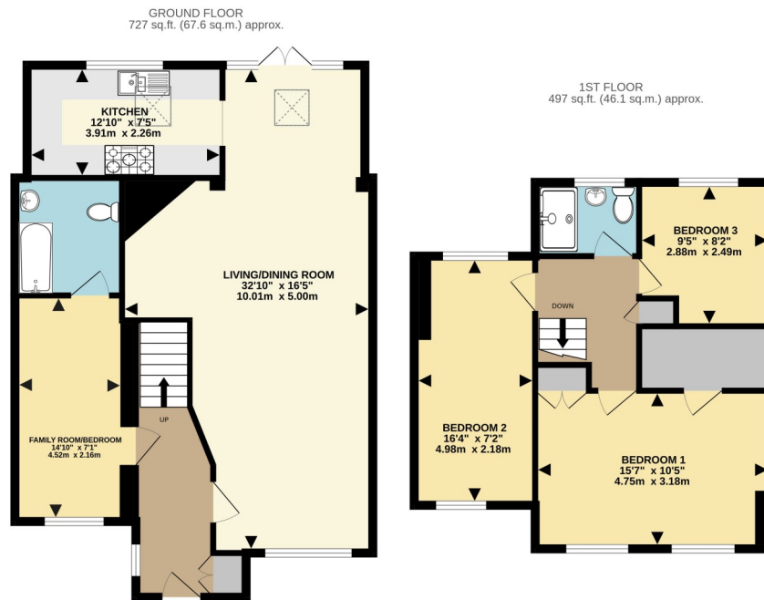
TOTAL FLOOR AREA: 1224 sq.ft. (113.7 sq.m.) approx. Drawn by Urban & Rural, not to scale Made with Metropix ©2023