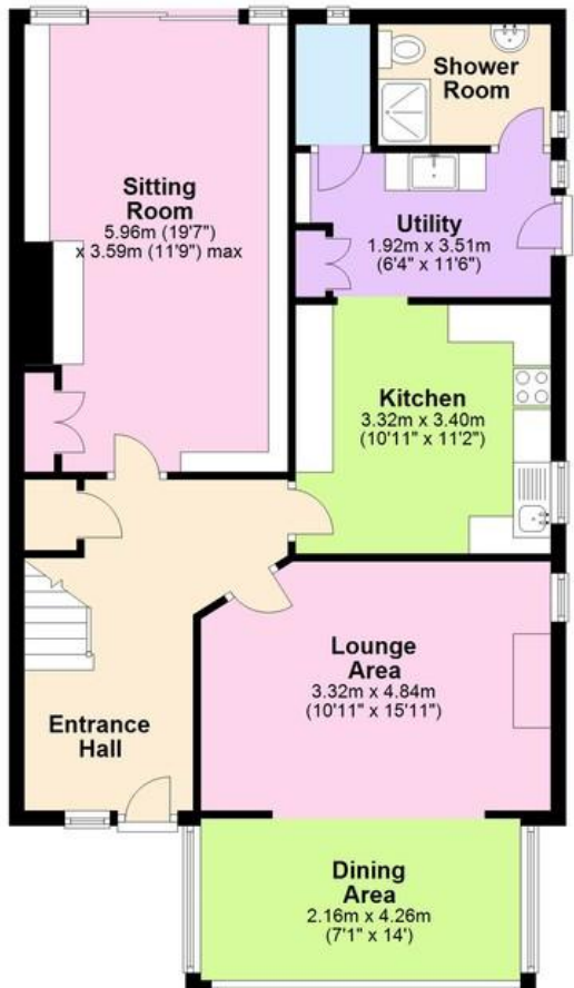
First Floor Approx. 64.0 sq. metres (689.2 sq. feet)