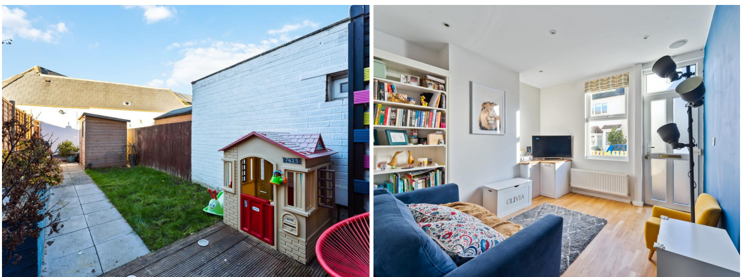
4 Upper Road, Wallington, Surrey, SM6 8JY | £400,000 Freehold

Paul Graham are pleased to market this well presented 2 bedroom period house situated on a popular residential road close to Mellows Park. The property benefits from a separate reception room, open plan kitchen/diner, modern white suite bathroom and 2 good sized bedrooms on the first floor. Double glazed, gas central heated and has a cellar. Viewing recommended.