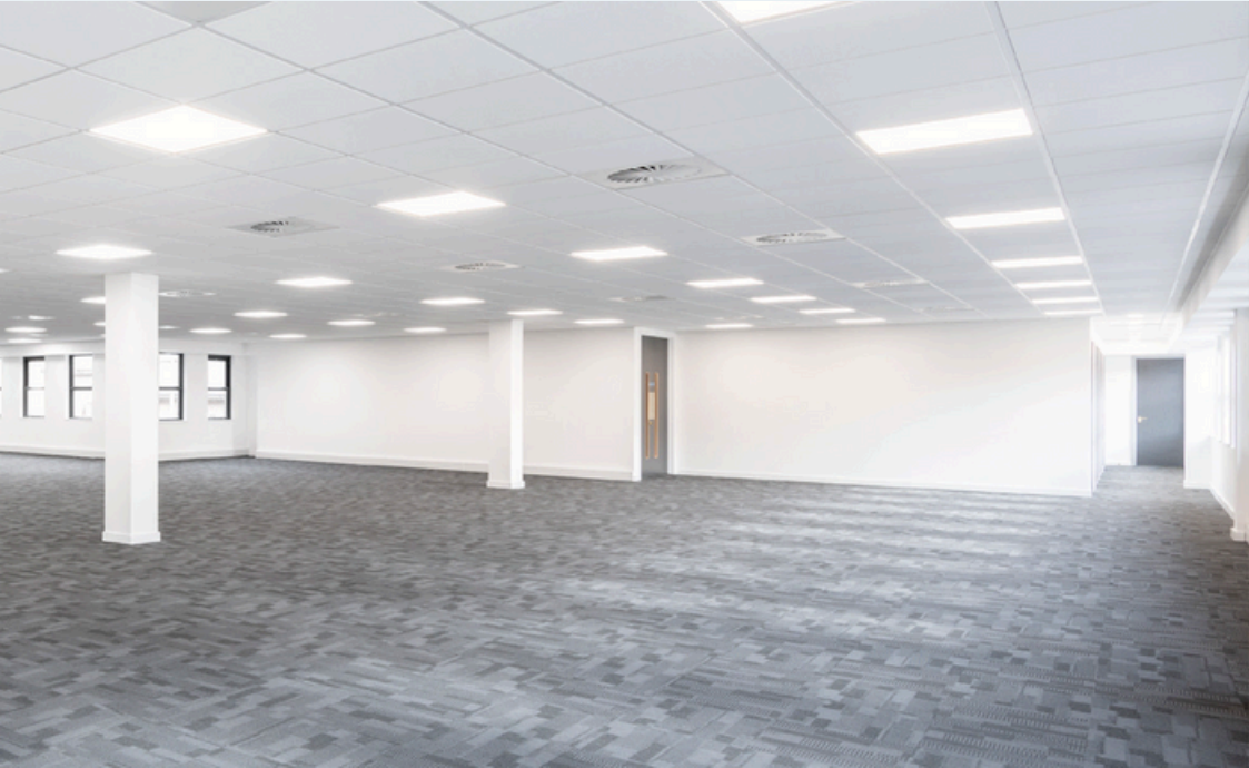
Above: Refurbished open plan office space.