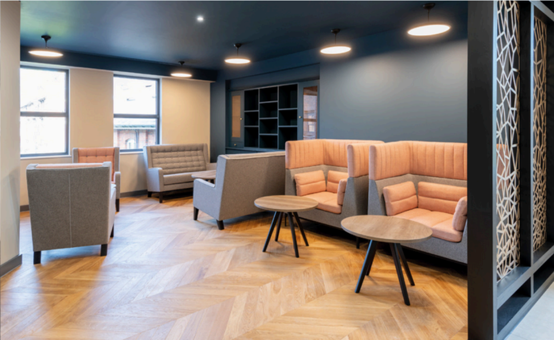
Above: Refurbished ground floor meeting area.