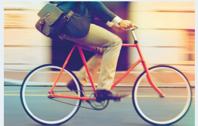
Top: Winchester Christmas market with stalls lining the high street. Middle: Enjoying a coffee at one of the many restaurants and cafés. Above: The smart way to get about in Winchester.