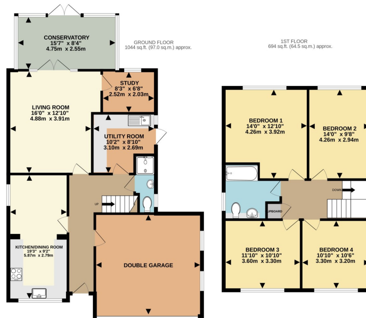
TOTAL FLOOR AREA: 1738 sq.ft. (161.5 sq.m.) approx. Drawn by Urban & Rural, not to scale Made with Metropix ©2023