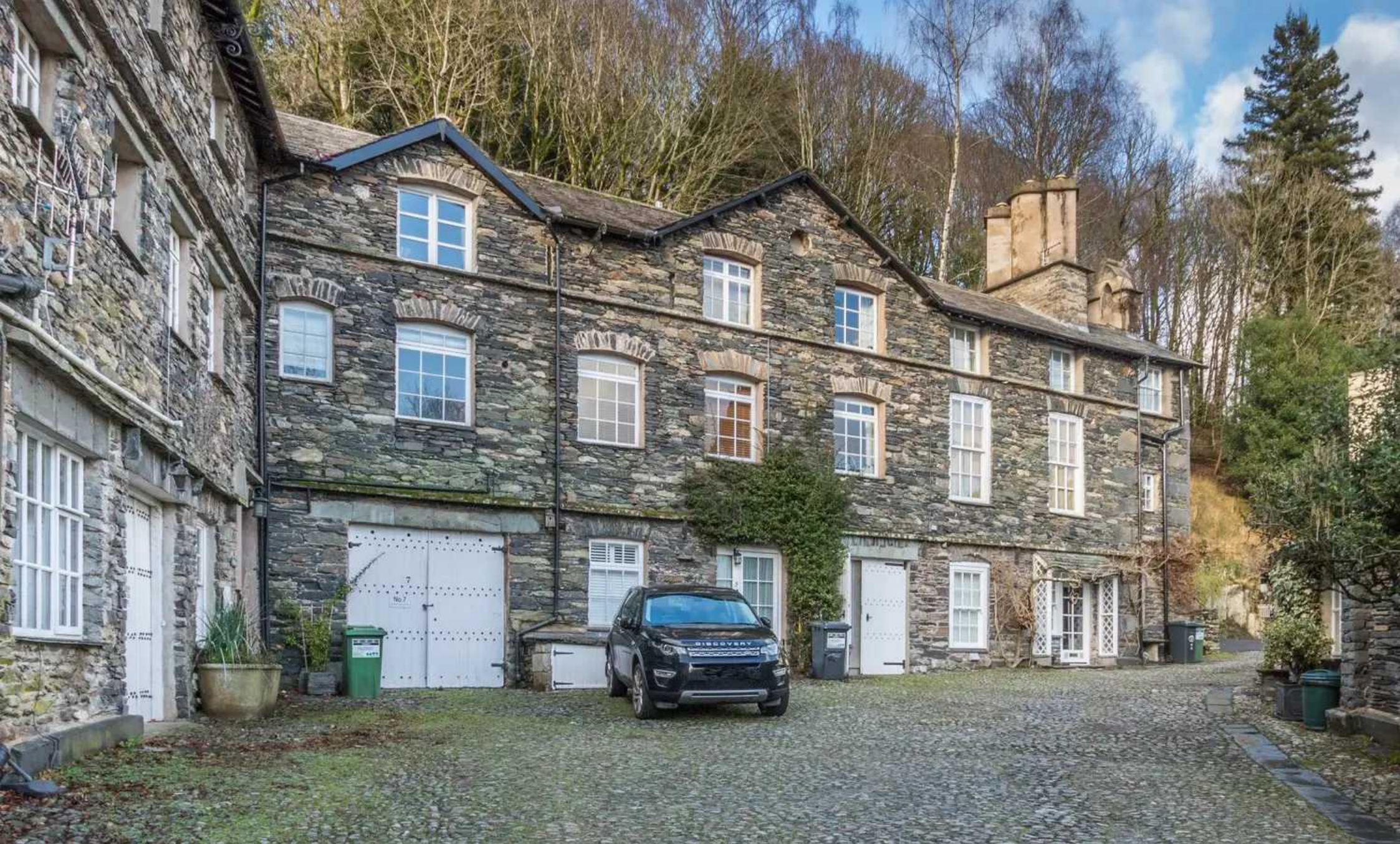
8 Croft Courtyard, Clappersgate £199,950