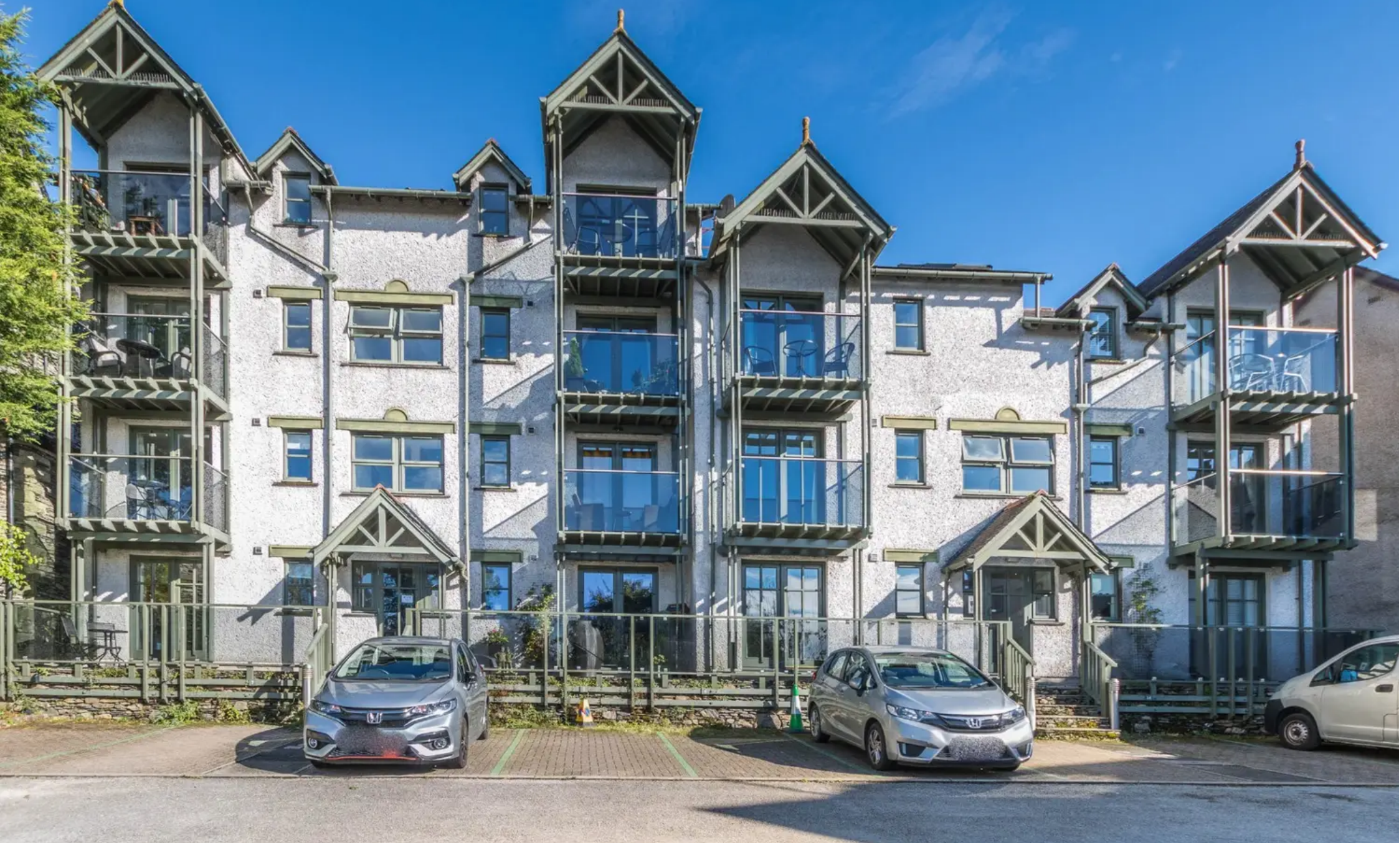
Flat 3, College Gate Elleray Road, Windermere £260,000