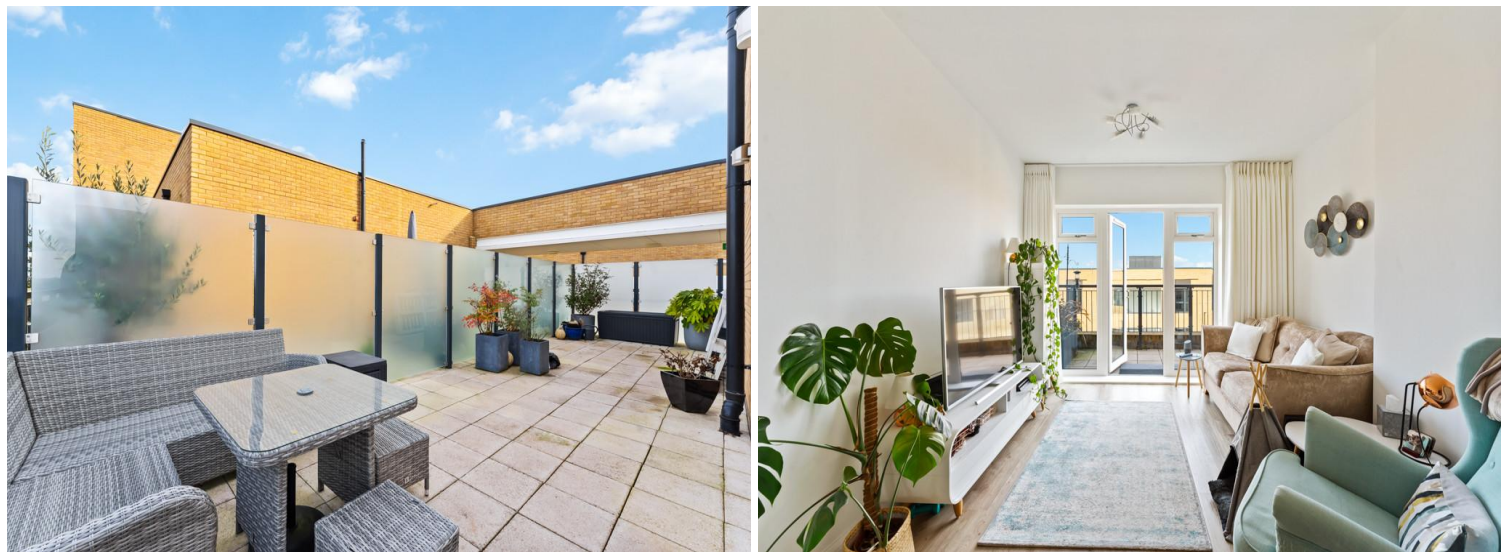
89 Chambray House, 188 London Road, Hackbridge, Wallington, Surrey, SM6 7FL | £290,000 Leasehold

Paul Graham are pleased to offer this modern 1 bed purpose built flat built in 2020, comes with a balcony, roof terrace and an allocated parking space in a secure under ground car park. Situated in the New Mill Quarter development across the road from Hackbridge train station. Viewing is recommended on this chain free property.