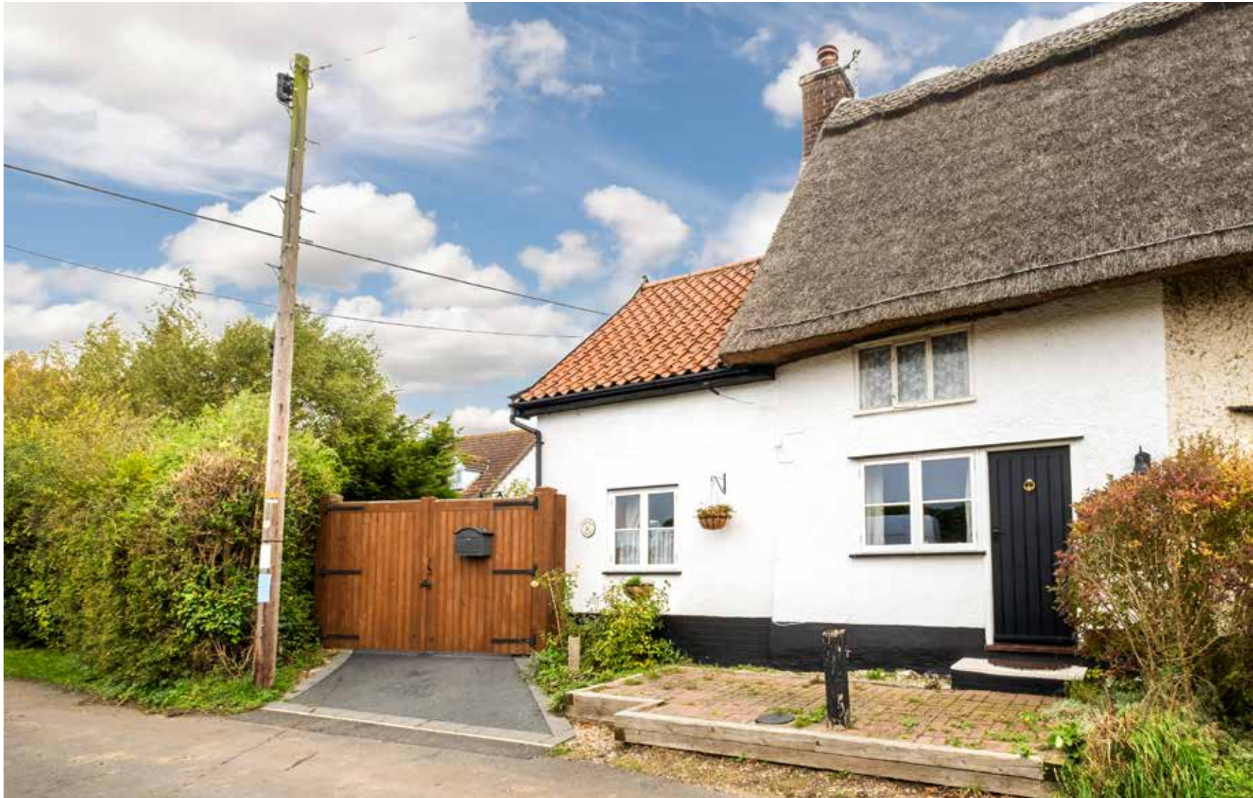
Charming Cottage in Sought After Village Pulham Market, Norfolk | IP21 4TB