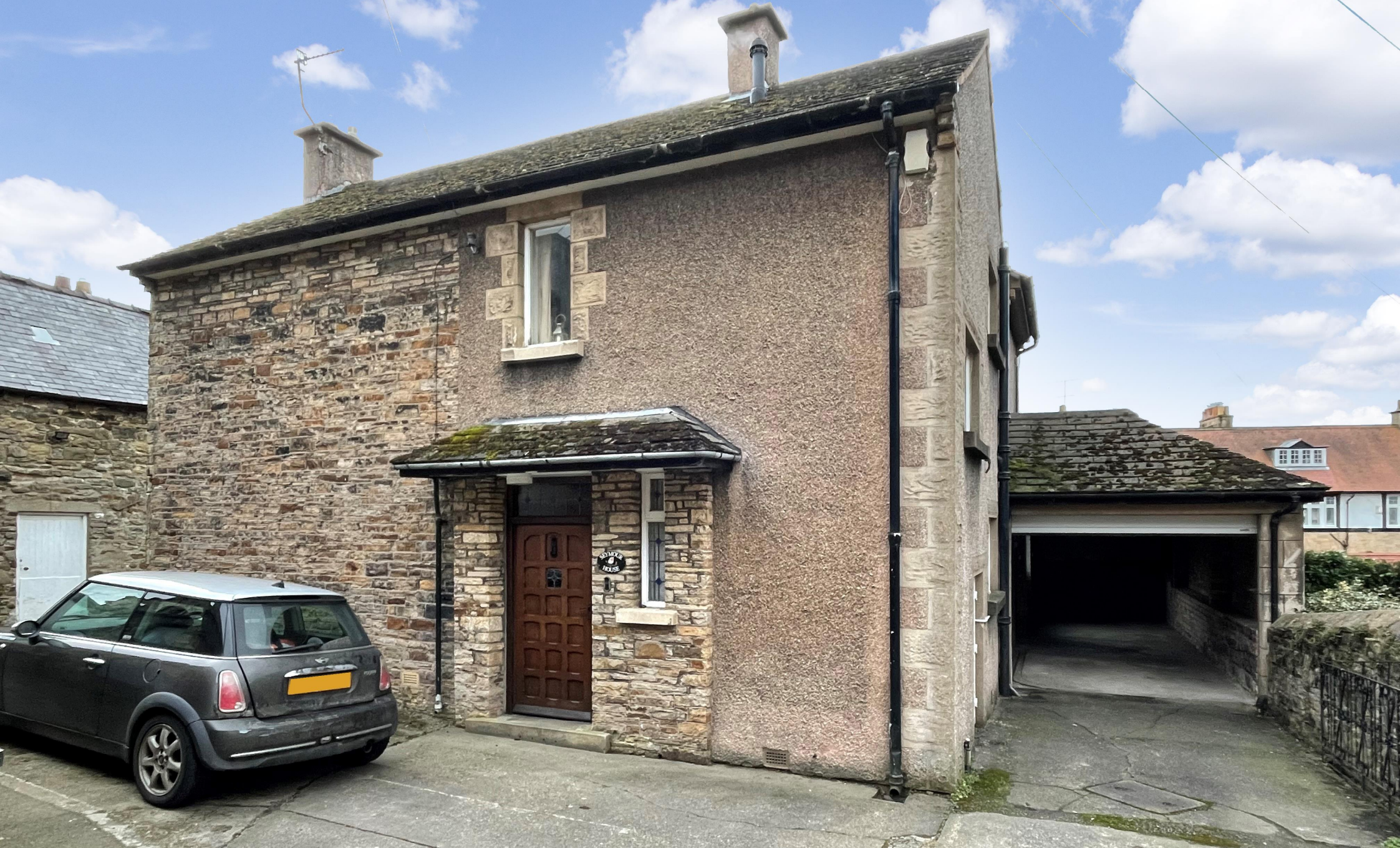
Seymour House, Edens Lawn, Haltwhistle, Northumberland, NE49 0AA