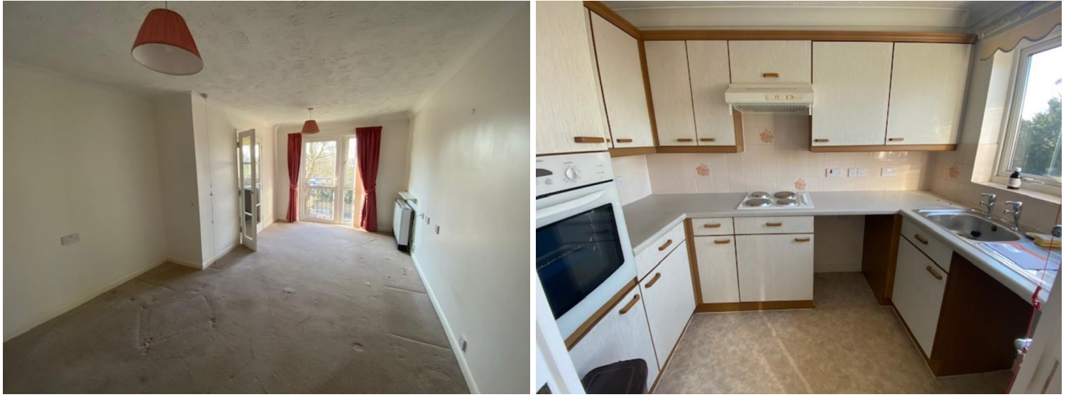
35 Marlborough Court, Cranley Gardens, Wallington, Surrey, SM6 9PG | £160,000 Leasehold

Located in a popular development this two bedroom over 60's apartment is close to local bus routes and within easy reach of Wallington town centre. The property boasts a 18'1 lounge with Juliette balcony and fitted kitchen. There are two bedrooms and a shower room. Outside there are well maintained communal gardens. Marlborough Court benefits from a large residents lounge with kitchen area, video entry system, guest suite, lifts and communal laundry.