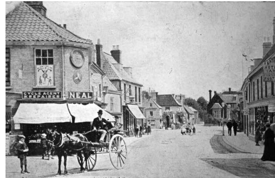
A historic photograph of Holt