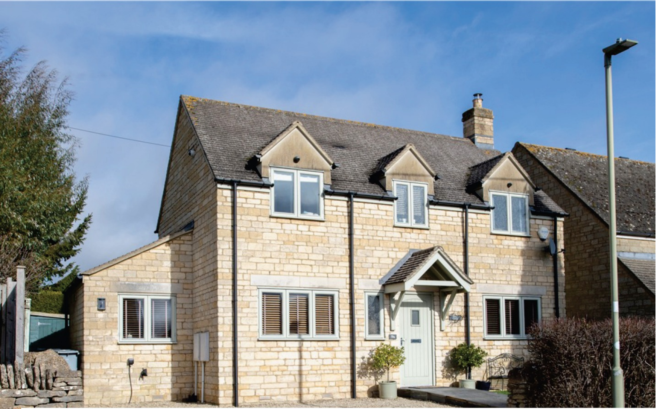
Sylvan Cottage, Leafield