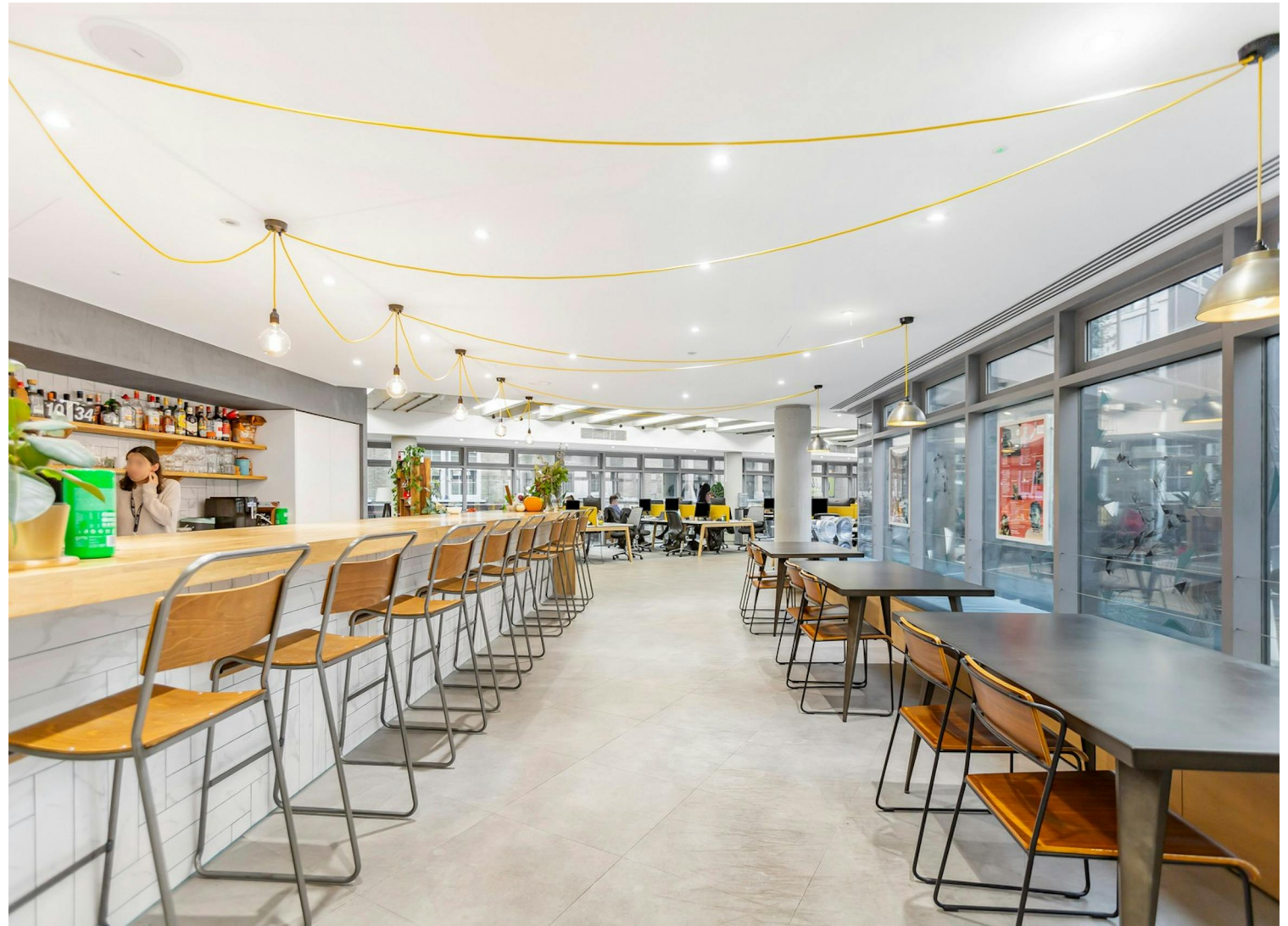
Kitchen / Breakout