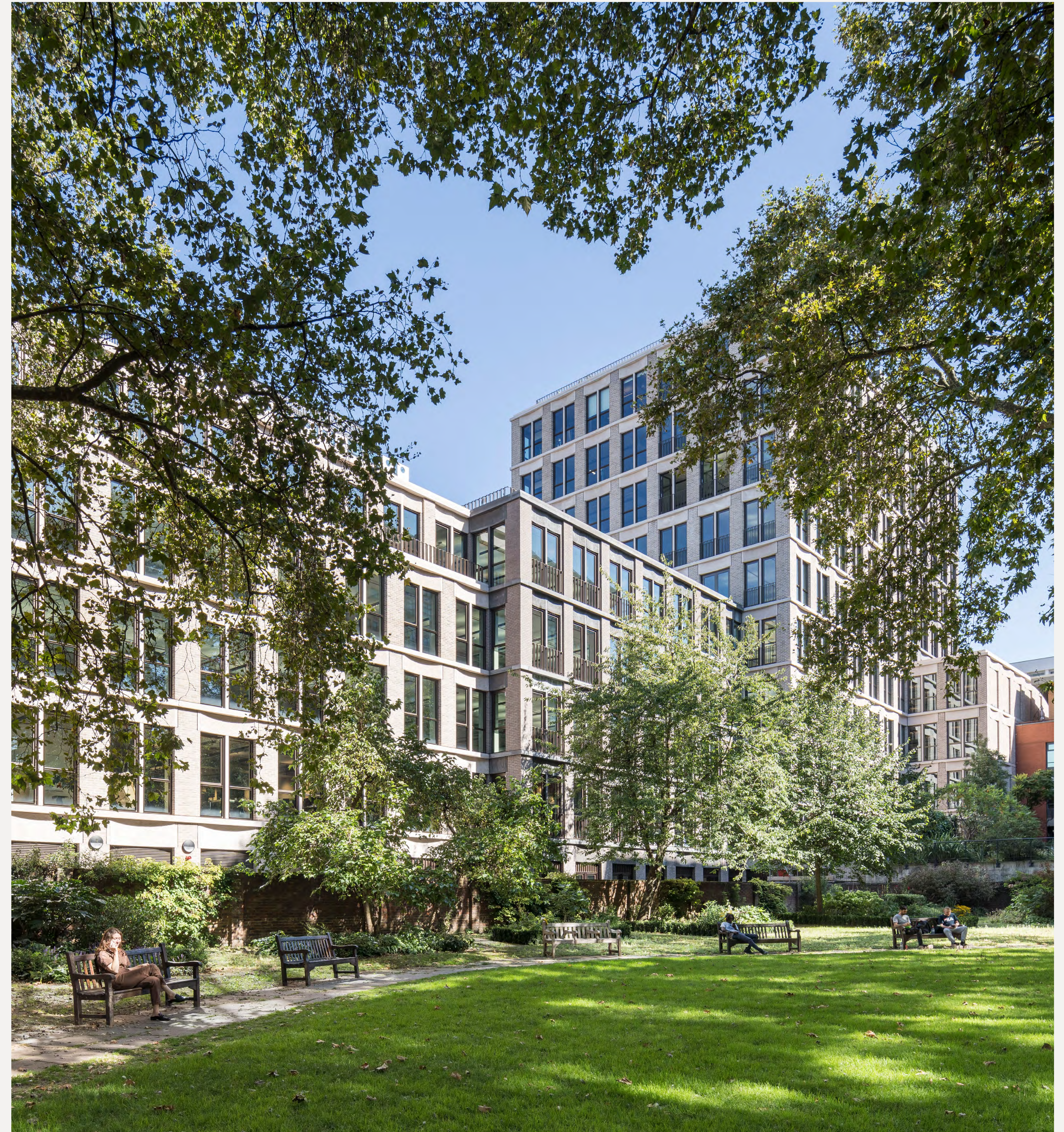
The Featherstone Building from Bunhill Fields