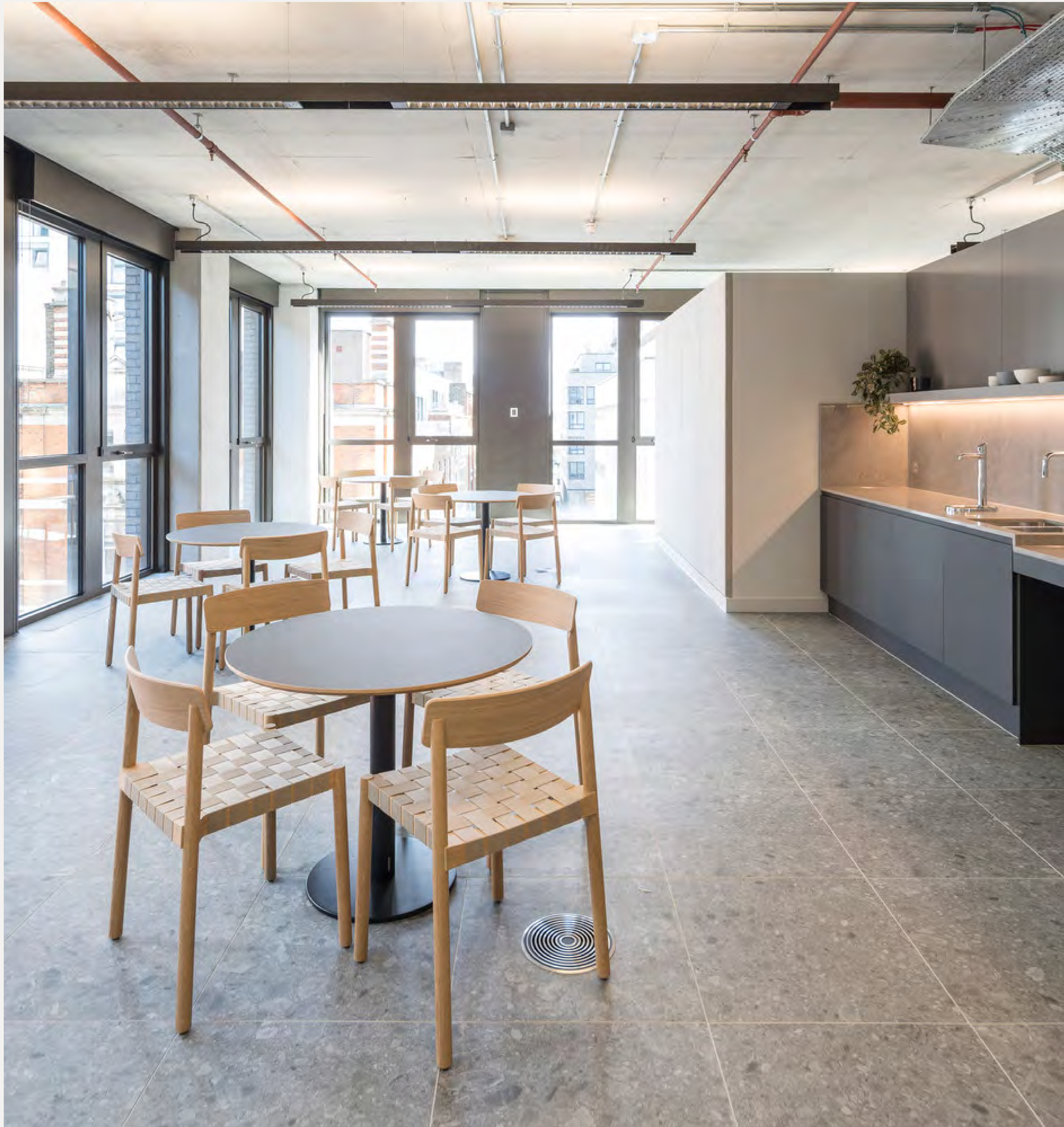
Kitchen and seating area