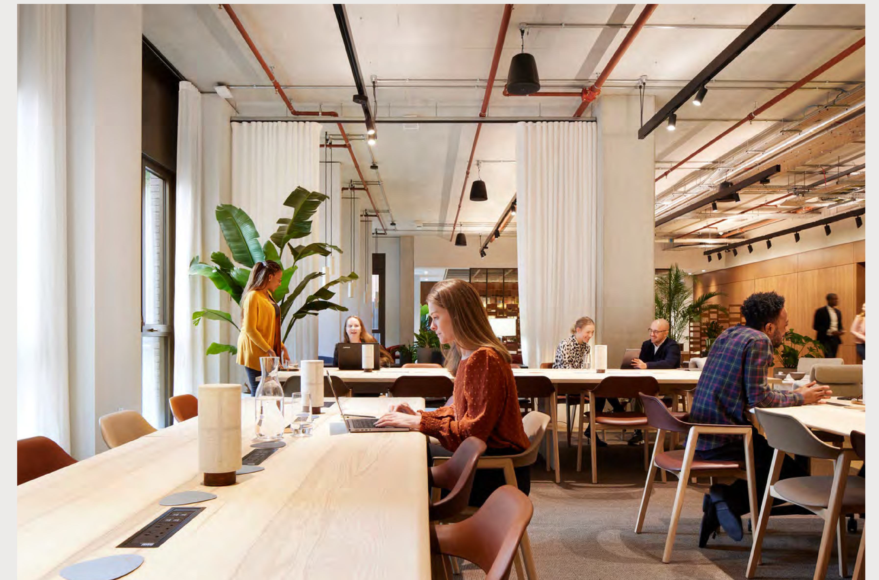
Drop-in working at DL/28