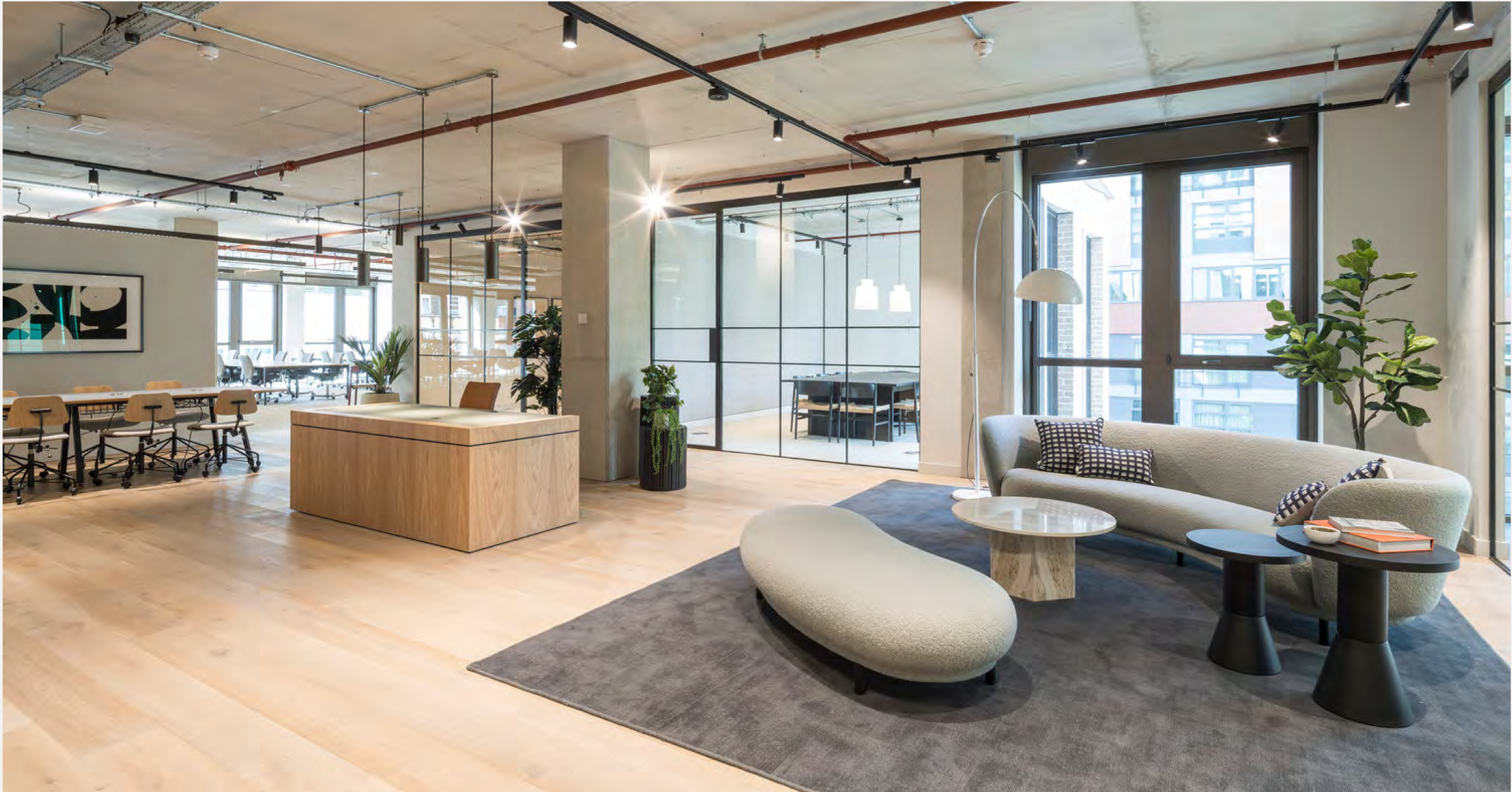
Reception and breakout space overlooking Bunhill Fields