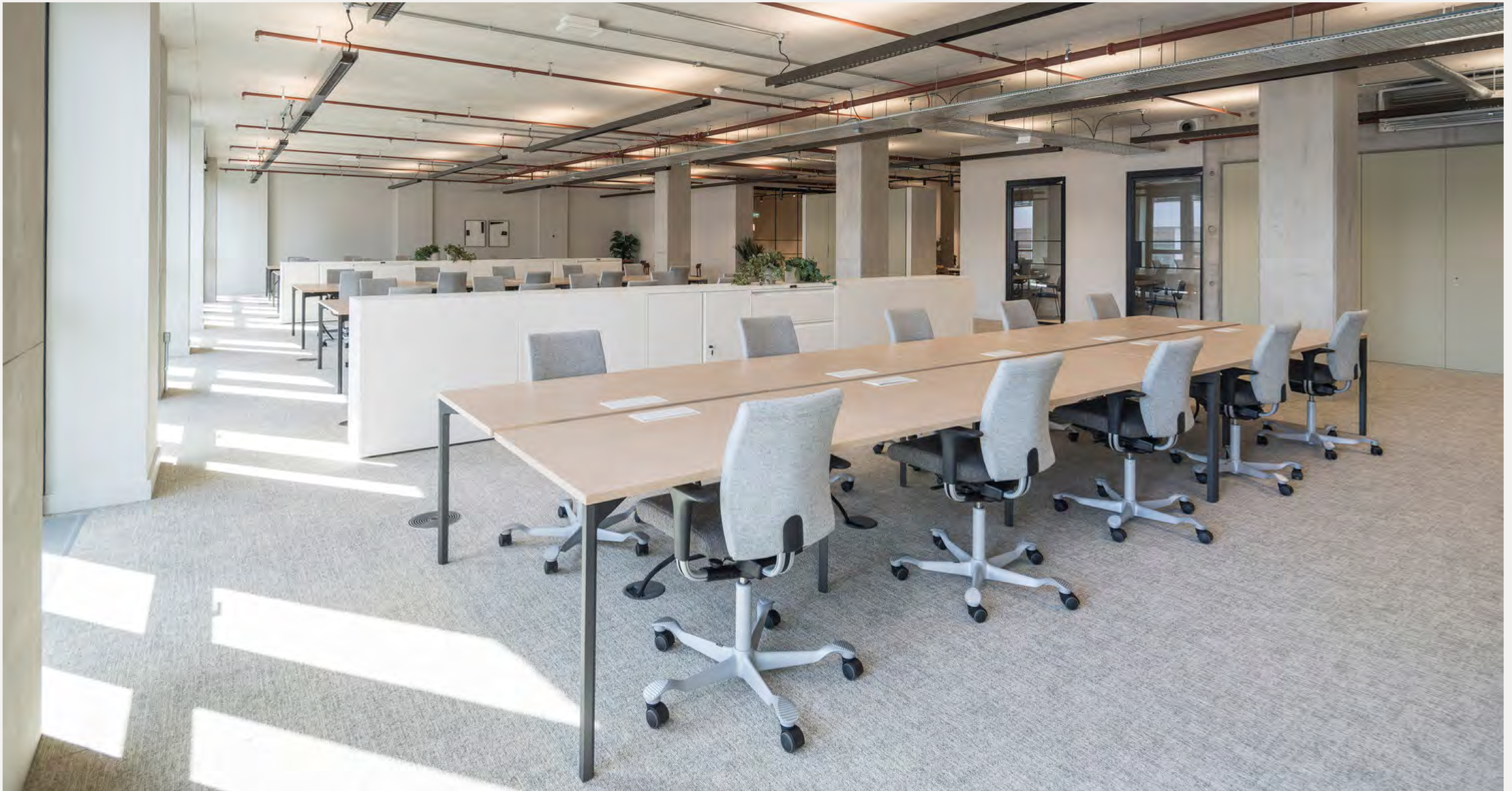
Workspace overlooking Bunhill Fields