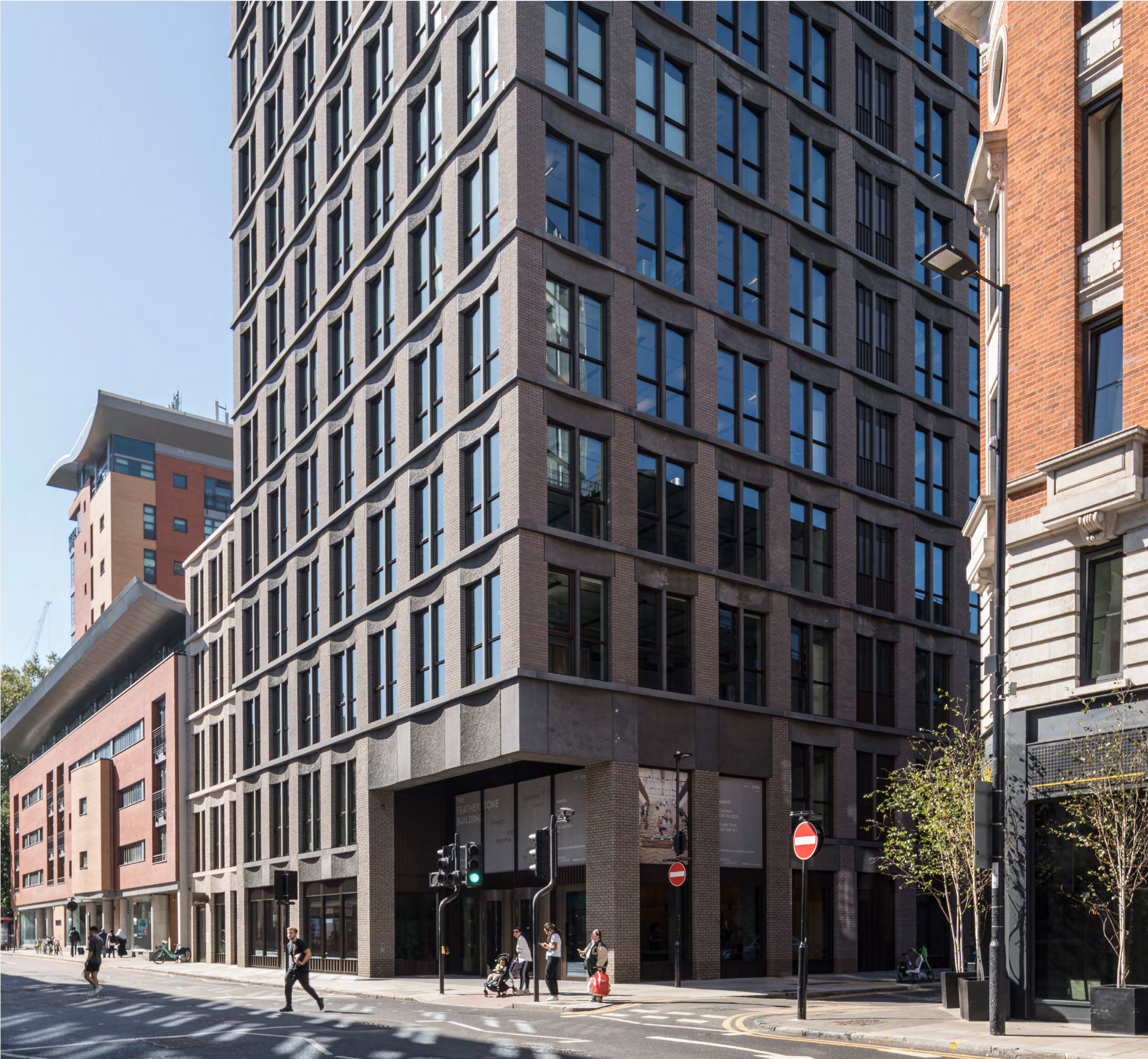
Sixty Six City Road, Old Street ECI

The Featherstone Building is a 126,700 sq ft industrial-inspired workspace with a contemporary finish, located in the heart of the Old Street district. 5,773 sq ft of Furnished + Flexible office space is available on the third floor.