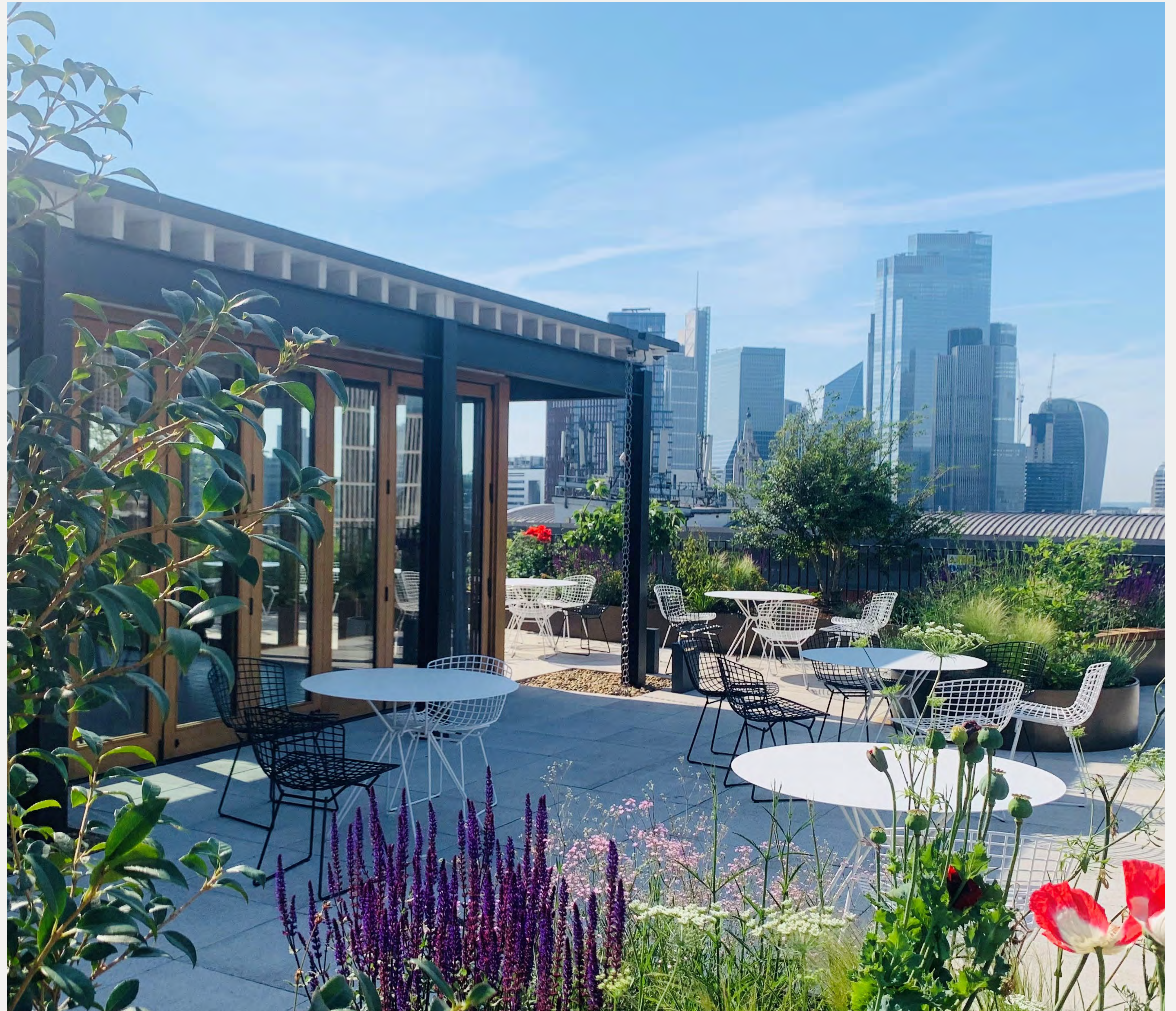
10th floor rooftop pavilion and terrace