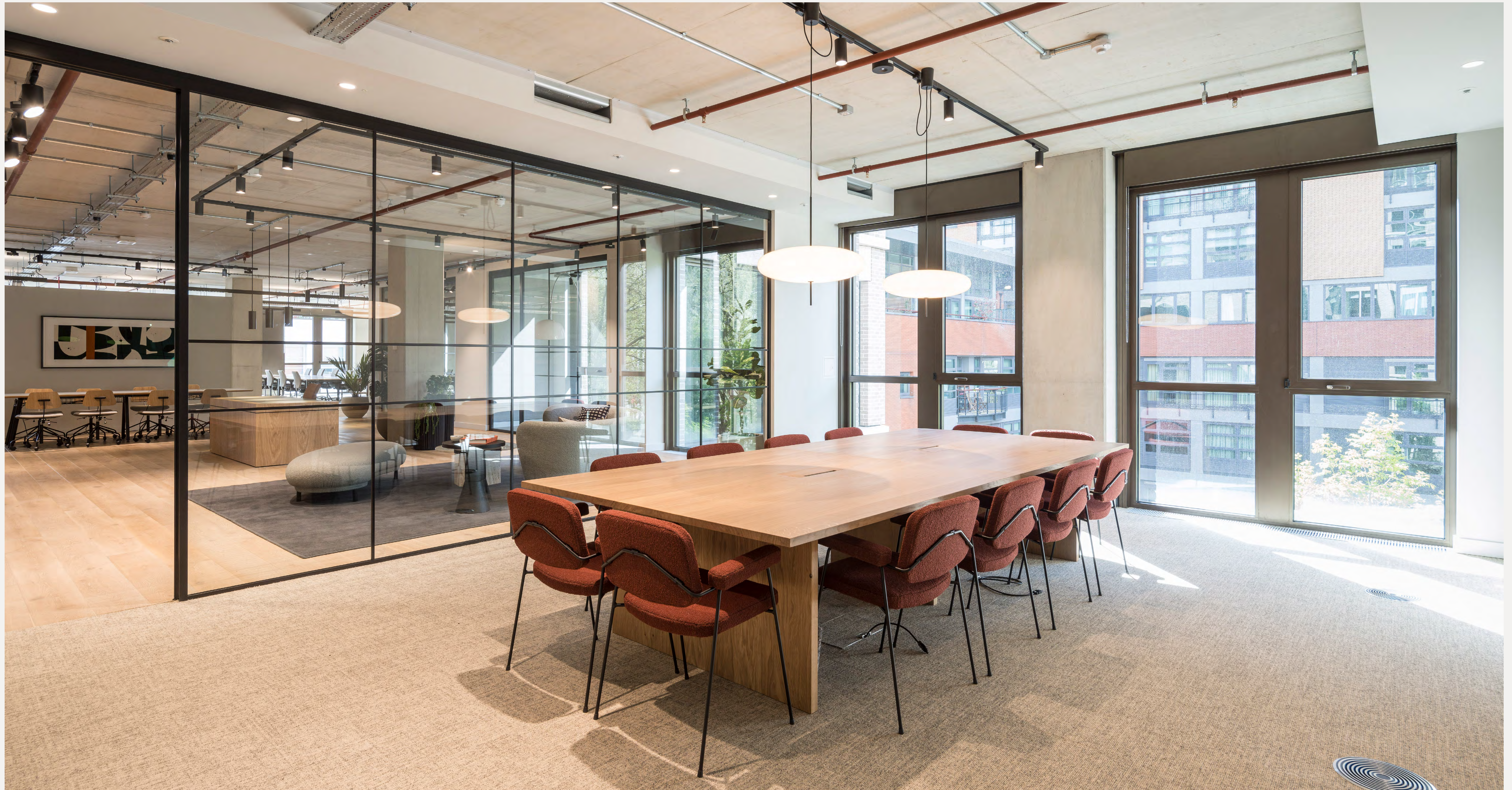
Spacious private meeting room