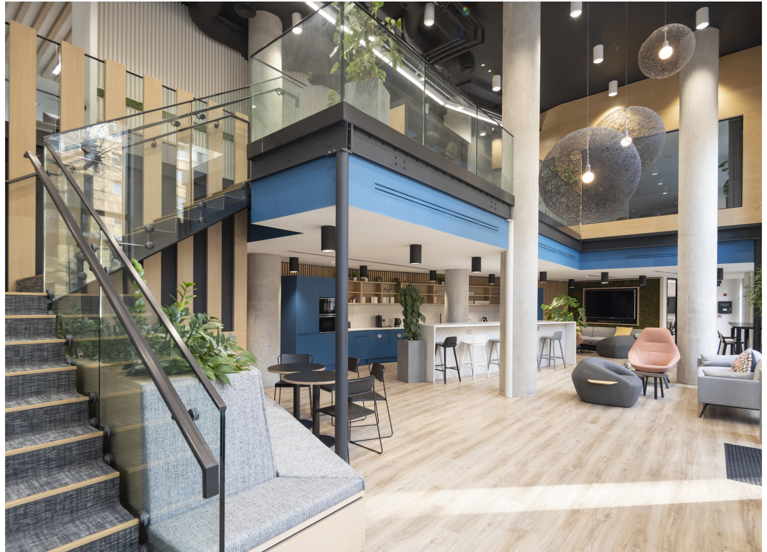
Double Height reception