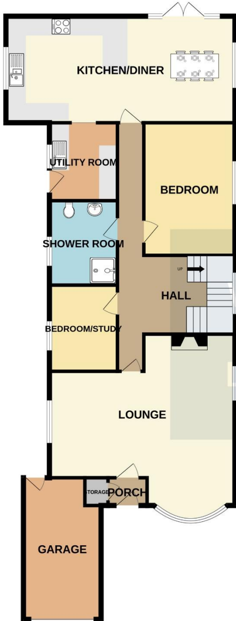
GROUND FLOOR 1349 sq.ft. (125.3 sq.m.) approx.