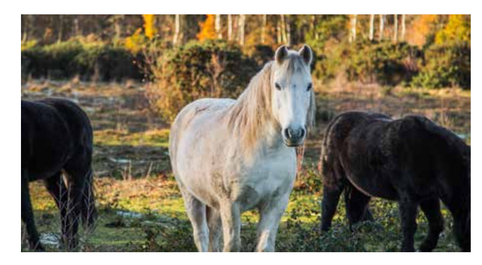
Horses on a nearby field.

"There are endless countryside walks right on the doorstep."