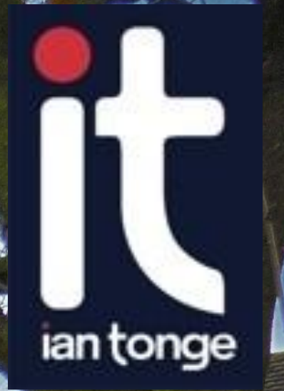
Grasmere Crescent, Stockport, SK6