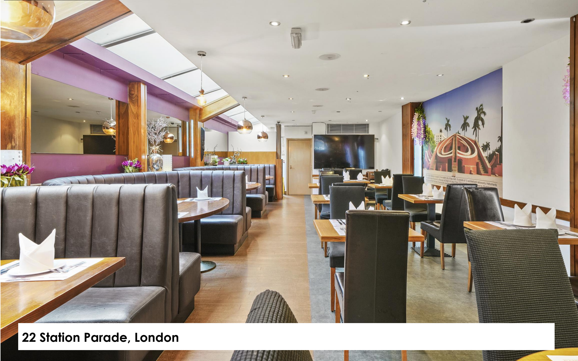
22 Station Parade, London