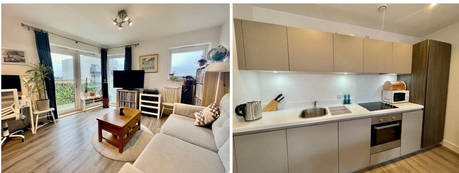
74 Otter Drive, Carshalton, SM5 2FH | £240,000 Leasehold

A modern one bedroom top floor flat in a popular development. The property is close to open spaces, bus routes and shops whilst Hackbridge station is nearby. Features include a large corner balcony with a Westerly aspect, lift access and allocated parking space. This property has great views and benefits from a long lease