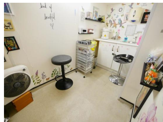
The Purple Shop | Fonnereau Road | Ipswich | IP1 3JR