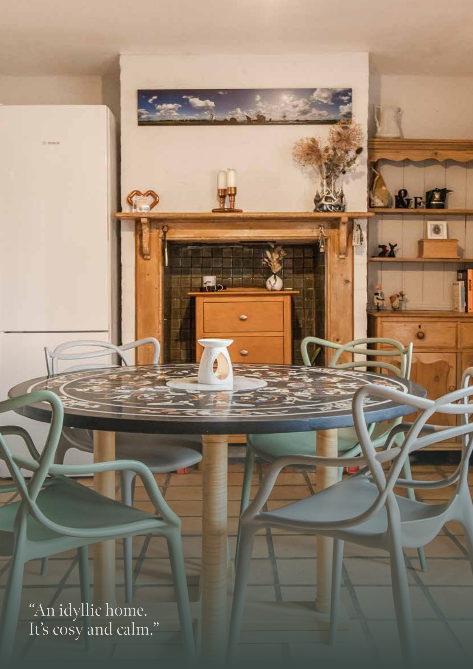
“An idyllic home. It’s cosy and calm.”