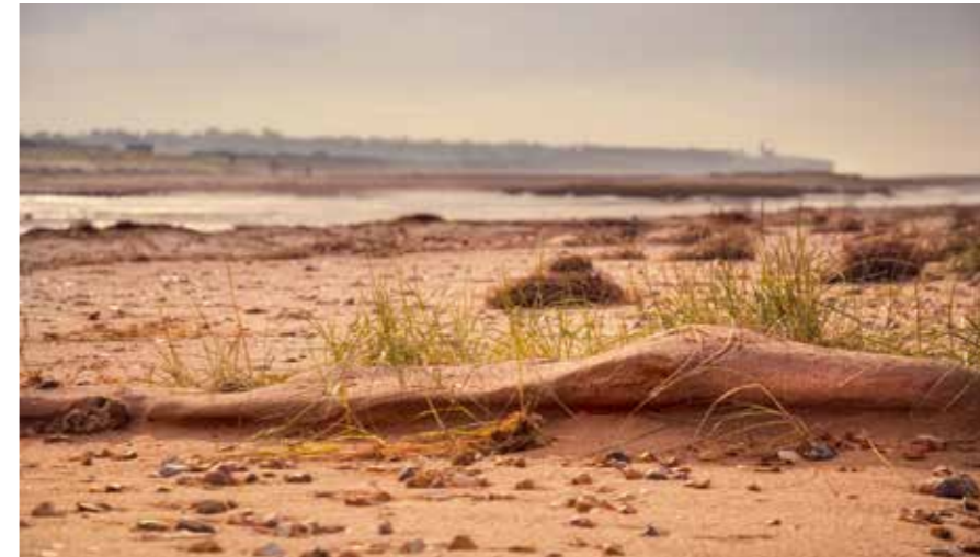
Sandy views at Holme-next-the-Sea.

“I've loved being able to explore the beaches at Brancaster or Holme, with endless sandy views.”