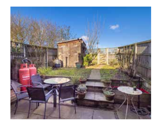
"In the summer, I love sitting in the garden with a good book, listening to the sound of birdsong."