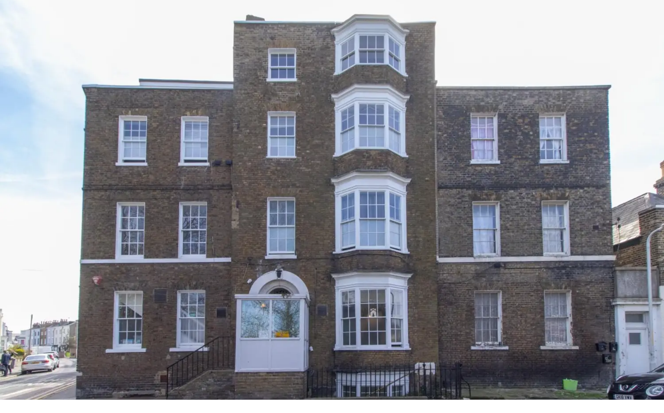
Flat 3, 18A St. Johns Road, Margate £185,000