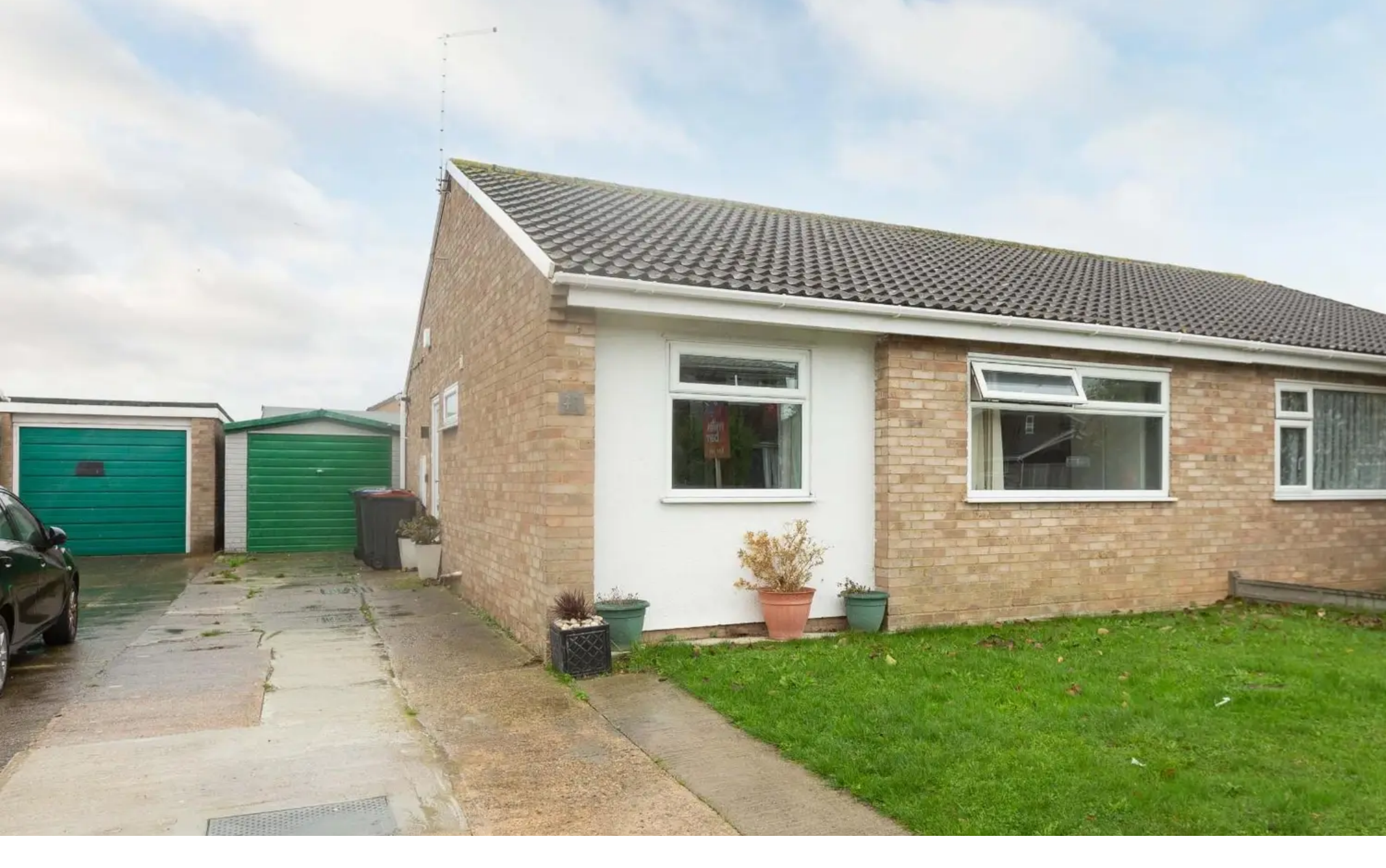
41 Coulter Road, Herne Bay In Excess of £290,000