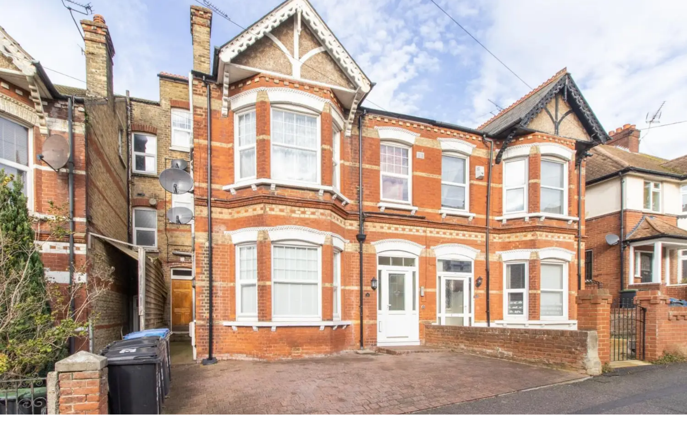
Flat 3, 32 Cliftonville Avenue, Margate £150,000